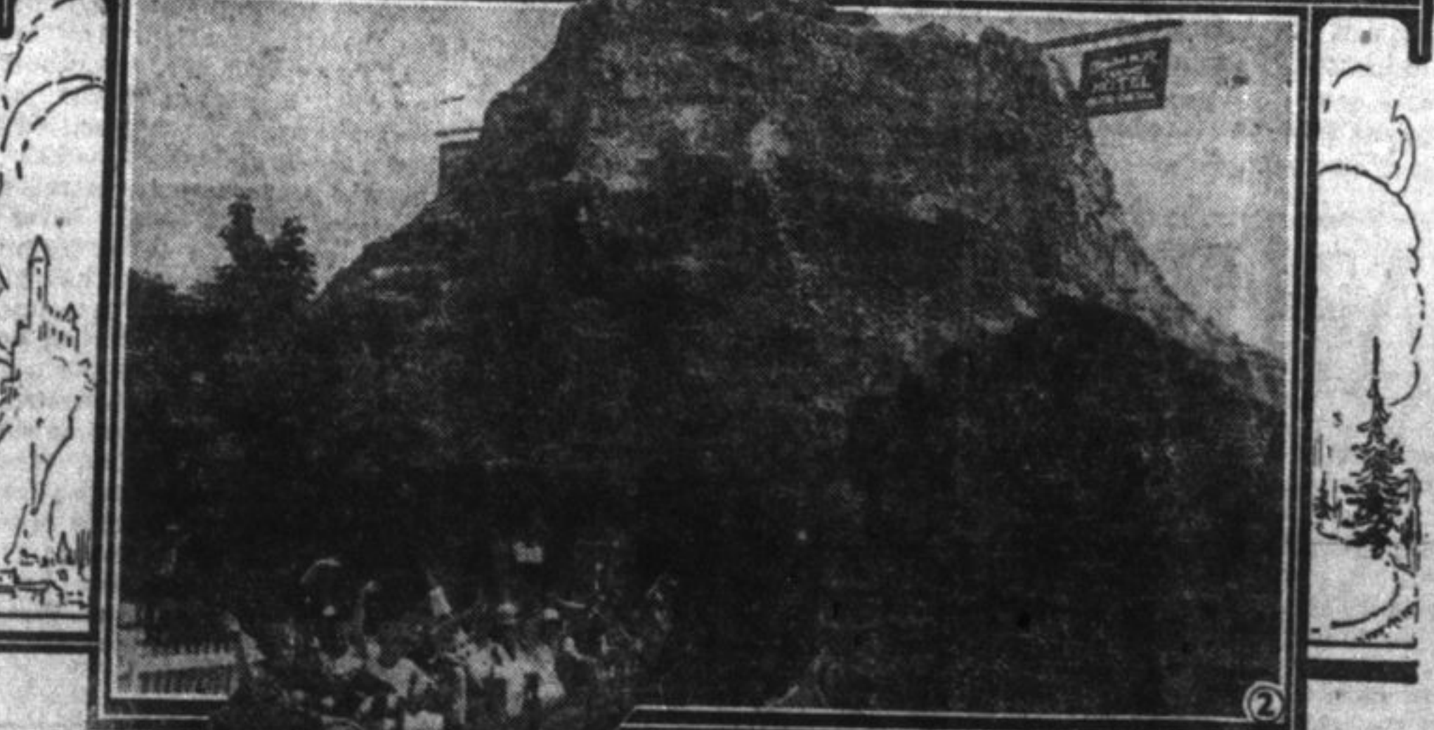
1. Complete and exact in every detail is this small engine, representing the largest type of engine used in the Rockies in Canada. This small engine pulls 30 people around the "Island" at one trip...