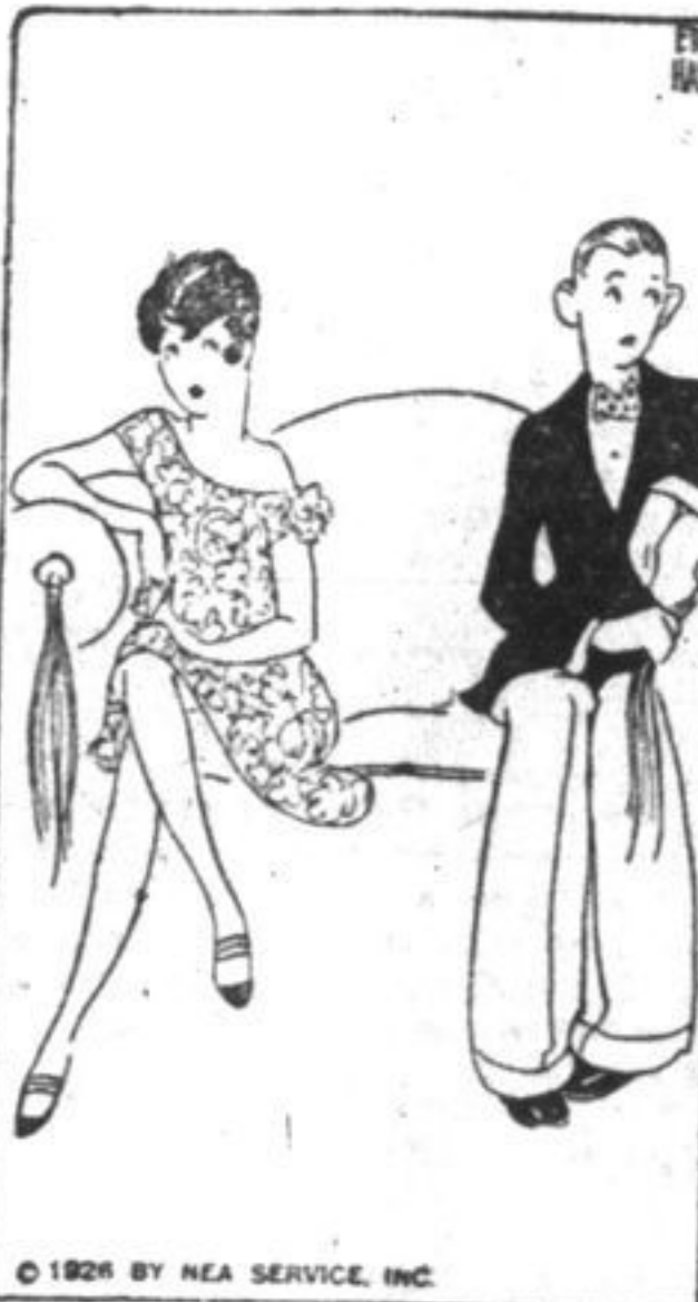
Some people could say what they think and still be quiet.

lery valued at £1,500 from the De Vere Hotel.