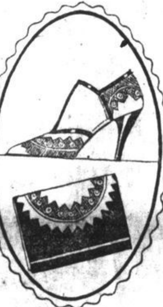
Lace straw in natural color and green lizard calf compose this charming shoe and bag combination.