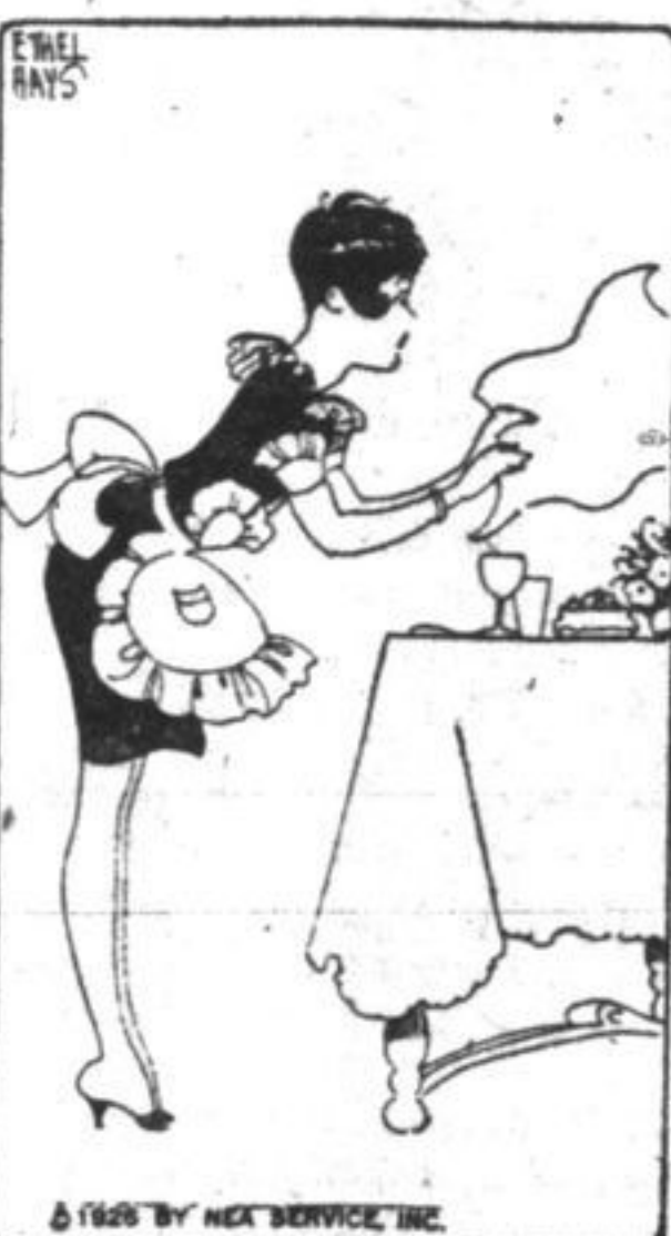
The monotony of setting a table is what makes it upsetting.