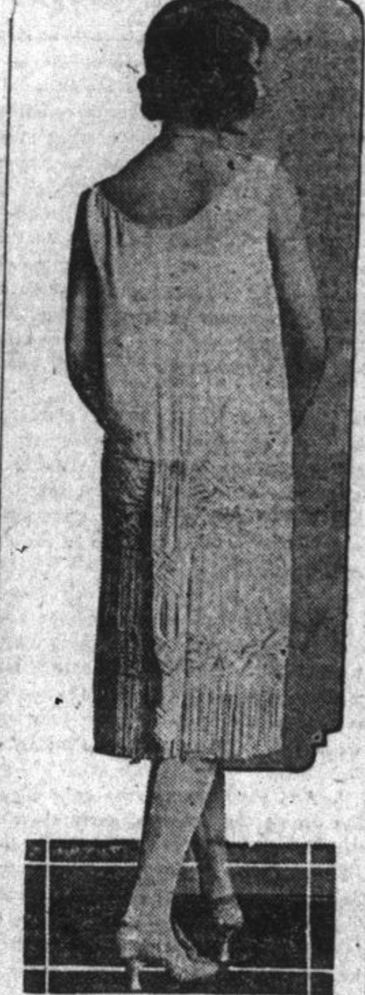
Fringed gown of pearls with two heavily beaded tabs hanging from waistline.

St. James Sunday school picnic. Steamer Waubic, Brophy's, Wednesday, July 21st. Adults 35c, children 20c. Boat 1 and 2 p.m.