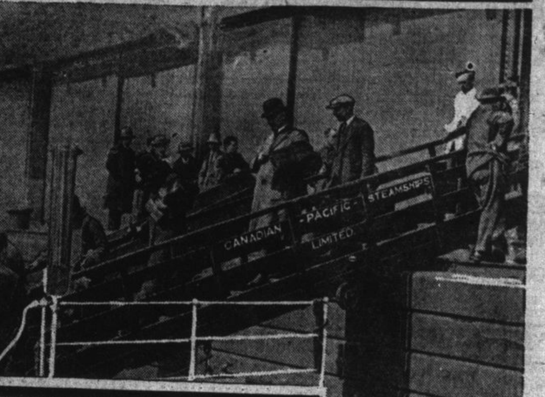
From Wits of Philippines to Wits of U. S. A. These Filipinos started to go to mission school only five years ago. Now they read and speak English fluently. Their English school teachers sent them to the United States where they will work their way through higher schools and universities.