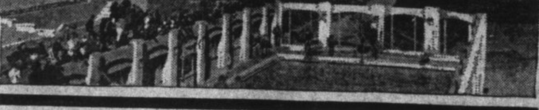
Glasgow students defied regulation bans and donned overalls to help load the Canadian Pacific liner Messageria during the recent strike in Great Britain.