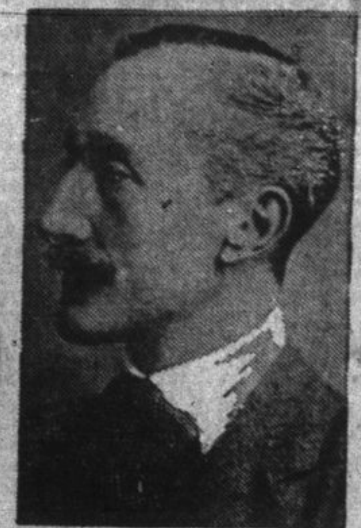
Canada's New Governor-General, Viscount Willingdon, Governor of Bombay from 1913 to 1919, who recently made a tour of the Dominion, succeeds Lord Byng.