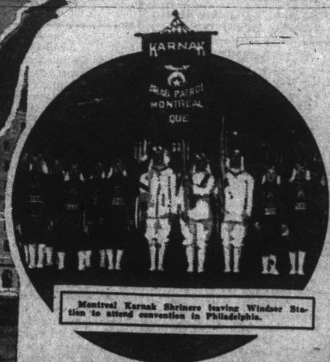
Montreal Karnak Shriners leaving Windsor Station to attend convention in Philadelphia.