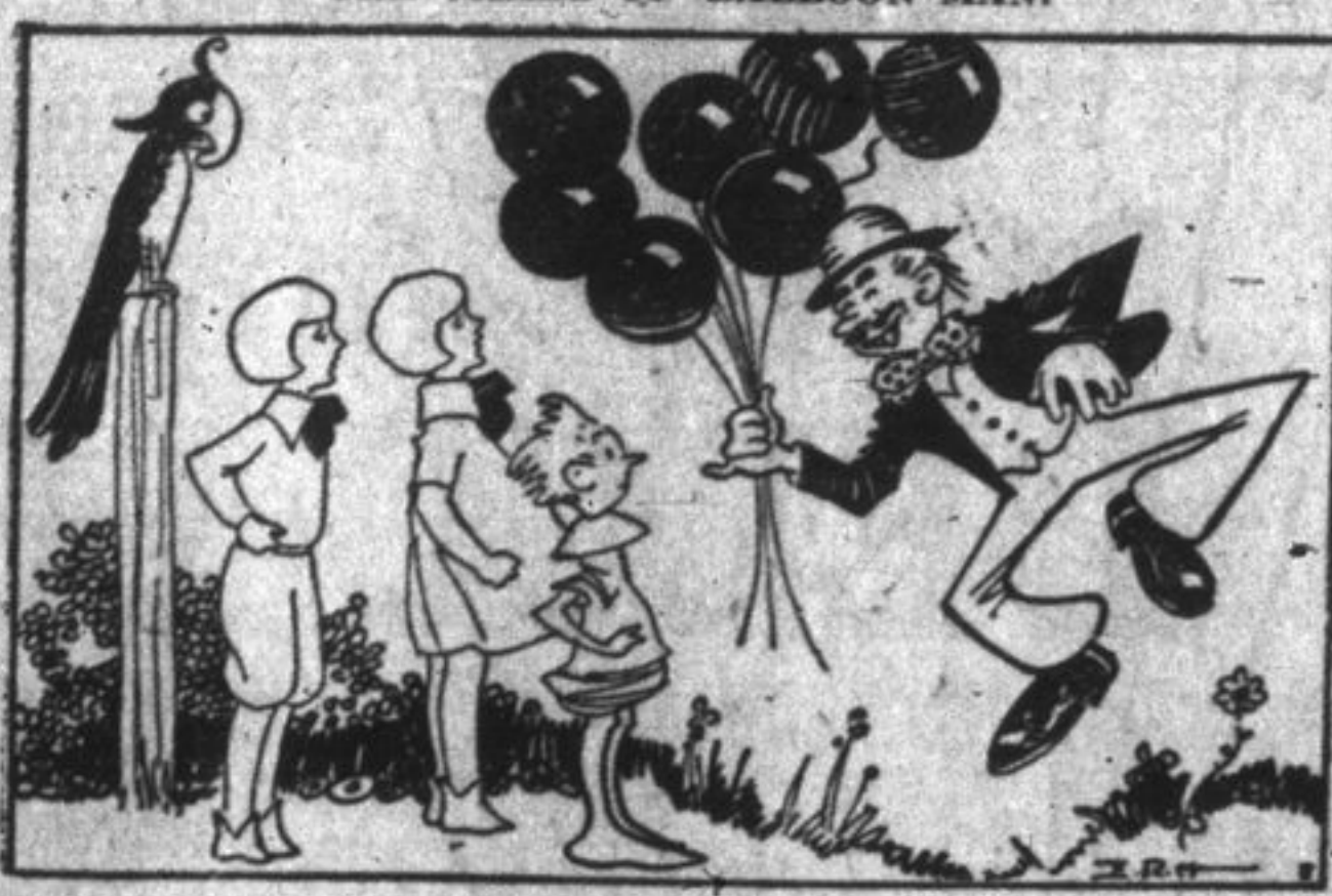
"Balloons, balloons, a bunch of balloons, They all go a-popping the loveliest of tunes."

The next person the Twins and the Whiffet met was the Balloon Man. "Balloons, balloons, a bunch of balloons, They all go a-popping the loveliest tunes," he sang. "Six times two and four more make seven. I've sold nineteen to-day." "Say," said Nick. "That's not the way to count. You're all mixed. Six times two and four make sixteen."