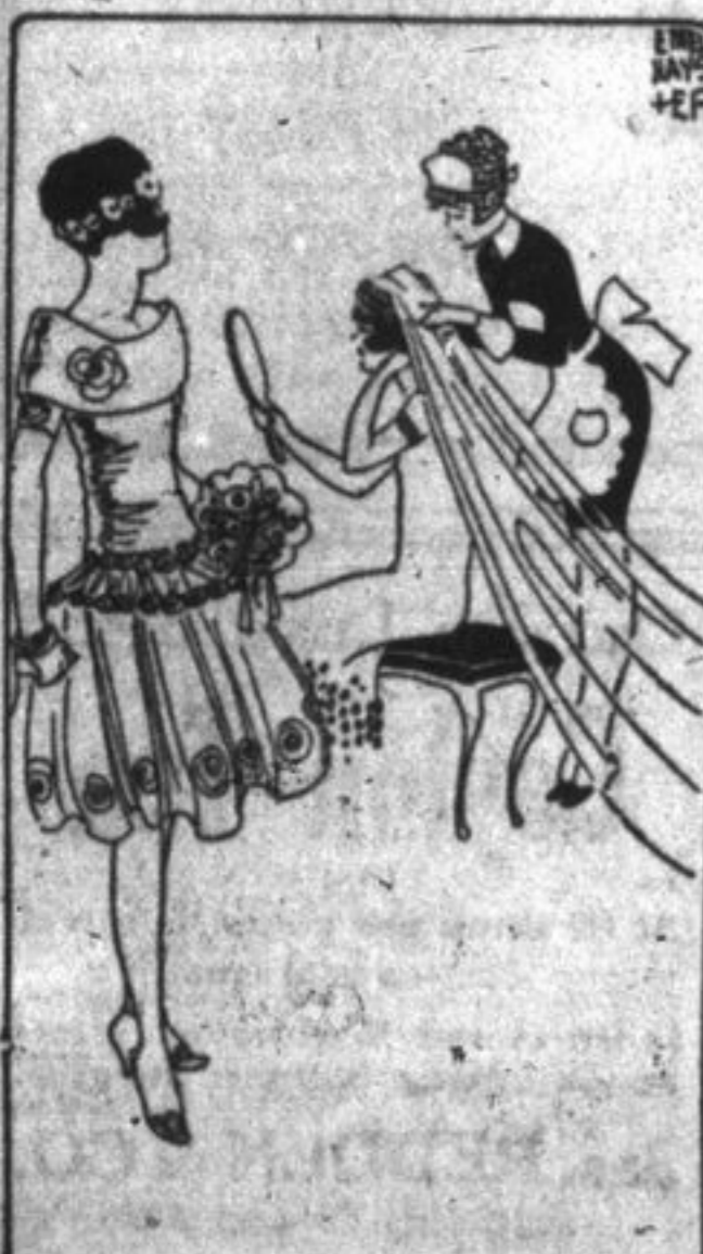
Some girls marry for better or for worse; others for more or less.