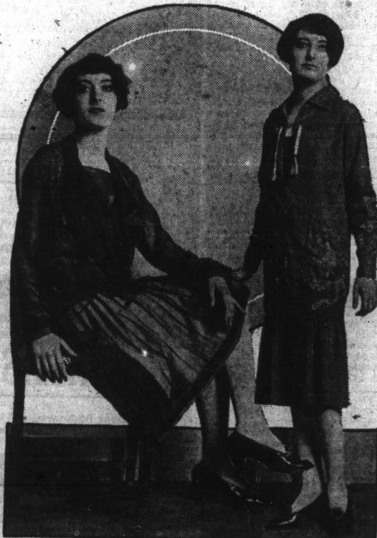
A printed chiffon jumper costume, left, and a light weight jersey, right, with skirt of silk—both for summer.

Paris lingerie is perfection. Of beautiful material in subtle shades, always hand made and perfect in line, it is as irresistible and as distinctive as Paris frocks. Here we have two samples. One is a combination outfit of orchid colored crepe, embroidered in white with a tracery of black, and bound with fine net. Perfectly flat knife pleats alternate with plain sections and take care of every bit of necessary fullness. The other is a smoking outfit of novelty silk in shades of blue and orchid, trimmed with wide ruchings of blue taffeta silk. The loose coat fits over a tailored pajama suit.