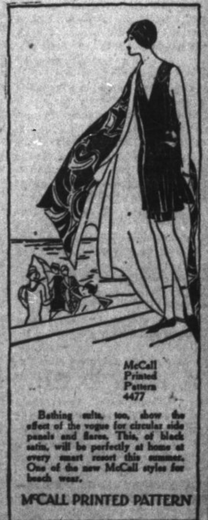
McCall Printed Pattern 4477

Bathing suits, too, show the effect of the vogue for circular side panels and flares. This, of black satin, will be perfectly at home at every smart resort this summer. One of the new McCall styles for beach wear.