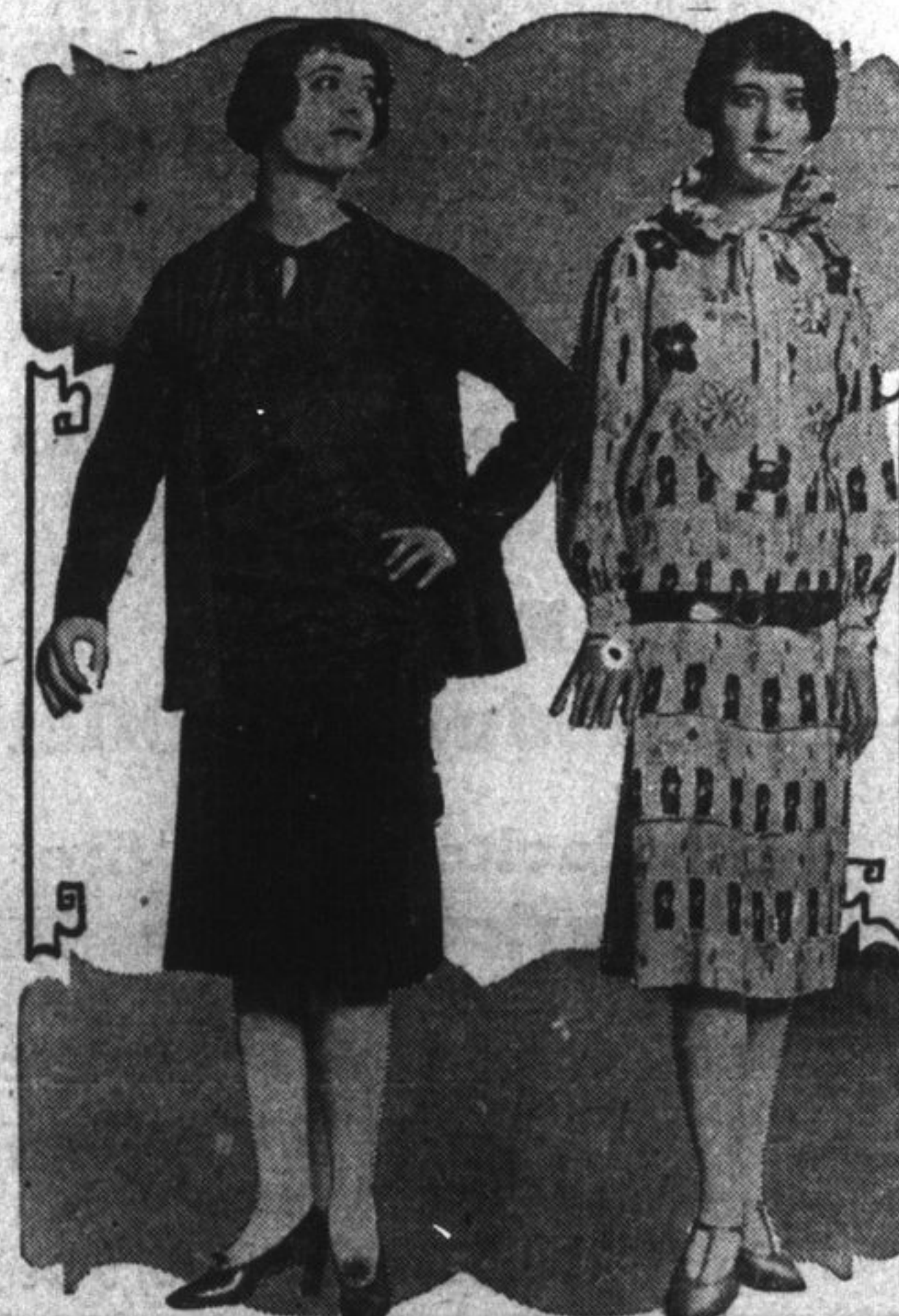
Three-piece outfit in blue and green, and a printed silk with one of the new ruff collars.