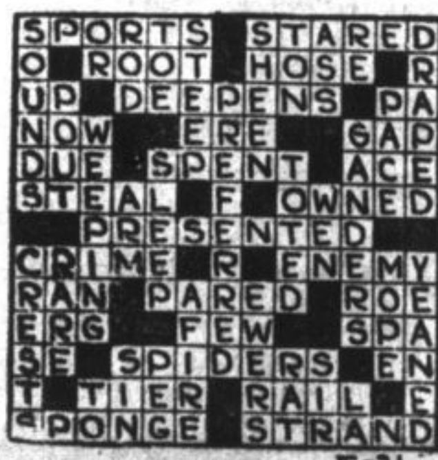
Answer to Friday's Crossword Puzzle.

10.39—Leary Smith's orchestra. 11—Cotton club orchestra. 11.30—Club Alabam orchestra. Midnight—Silver Slipper orchestra.