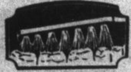
It goes where the tooth brush fails to reach—prevents acid decay.

Used when the gums are tender, sore or bleeding it heals and hardens them. It also acts as a tonic in strengthening and building up the tissues.