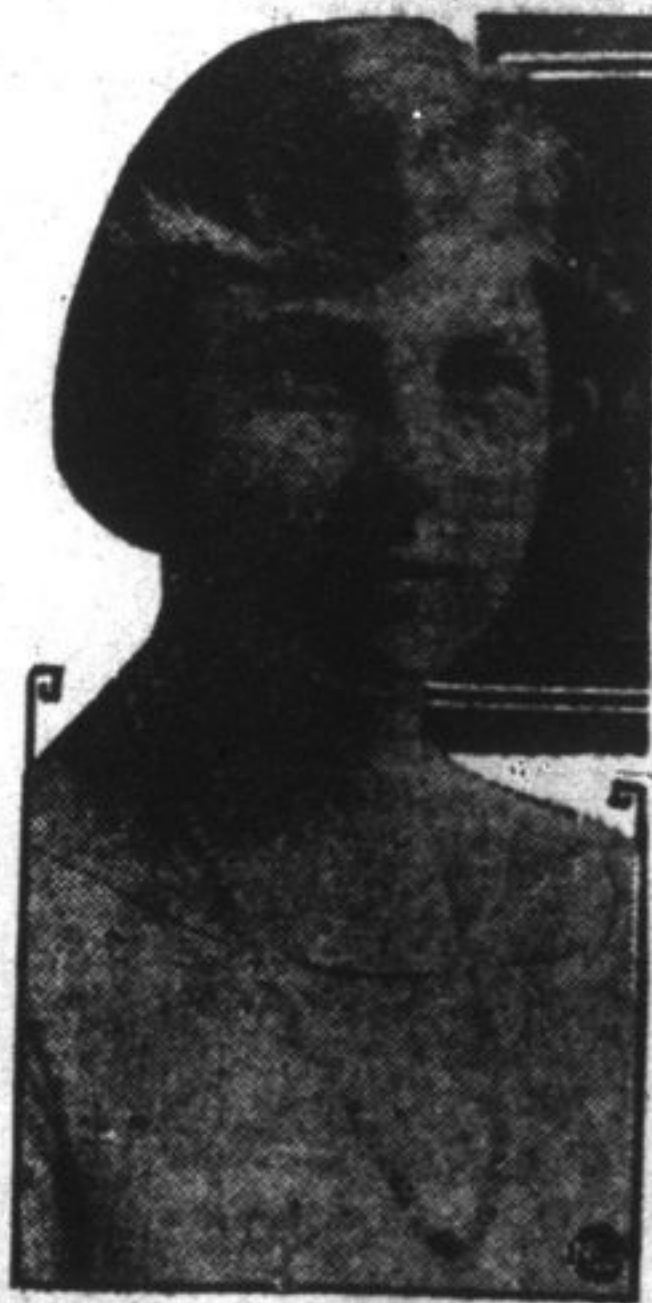
Lady May Cambridge, daughter of Princess Alice and Lord Athlone, High Commissioner to South Africa, is to wed Prince Olaf, heir to the throne of Norway, London, hears. Prince Olaf is twenty-two, and Lady May is twenty.