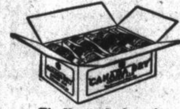
The Hostess Package of 12 bottles

By Appointment to Their Excellencies, The Lord and Lady Byng of Vimy