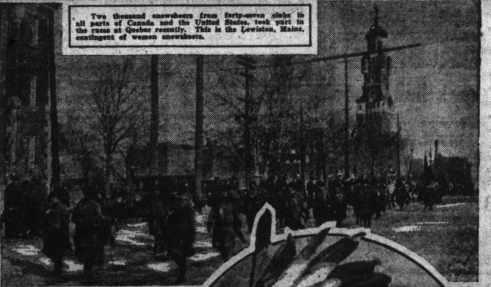
Two thousand snowshoers from forty-seven clubs in all parts of Canada and the United States, took part in the races at Quebec recently. This is the Lewiston, Maine, contingent of women snowshoers.