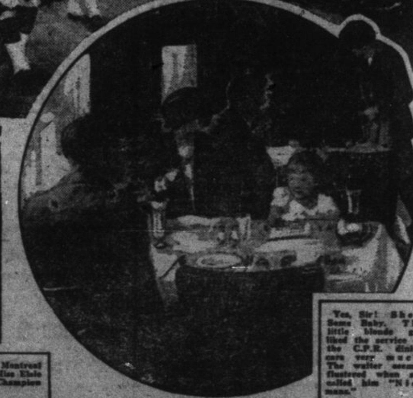
Yes, Sir! She's Some Baby. The little blonde girl liked the service on the C.P.R. dinner cars very much. The waiter assumed she was a friend of a friend, hence the crowd.