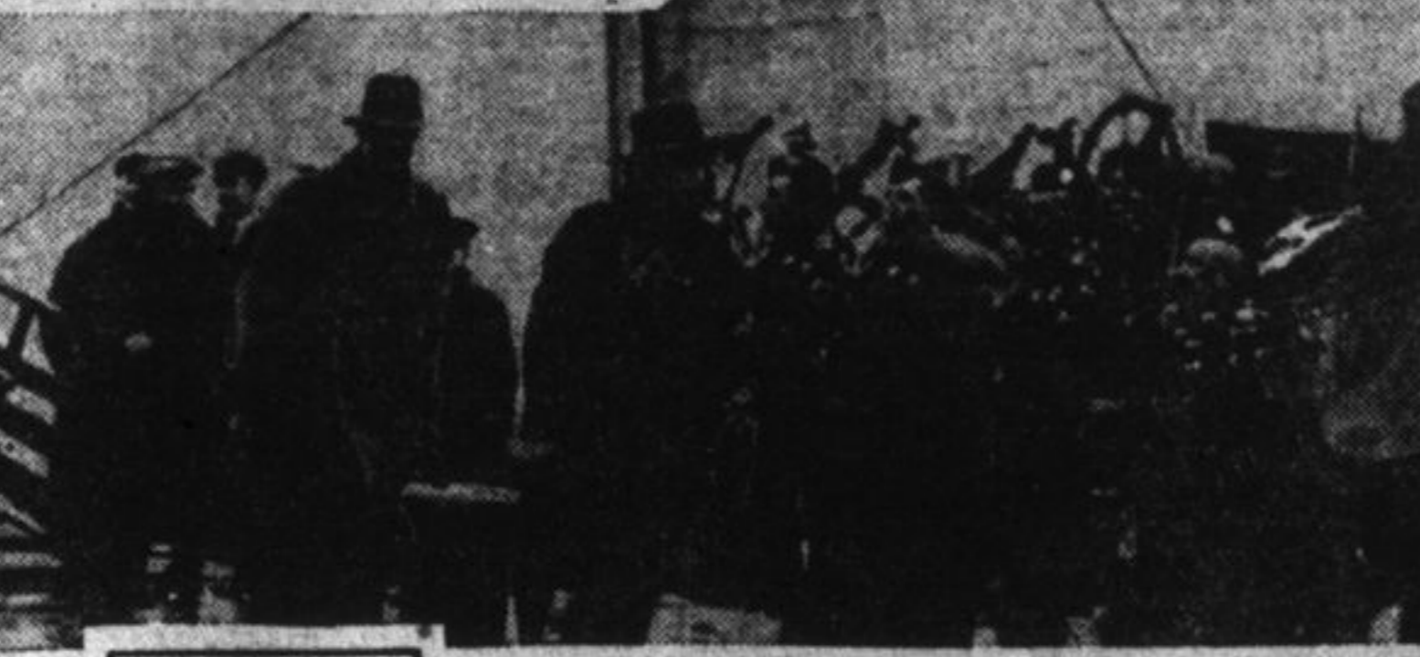
The Canadian Curlers who arrived at Gravenack in the C.P.R. liner Montrose, were welcomed by the Police Pipe Band.