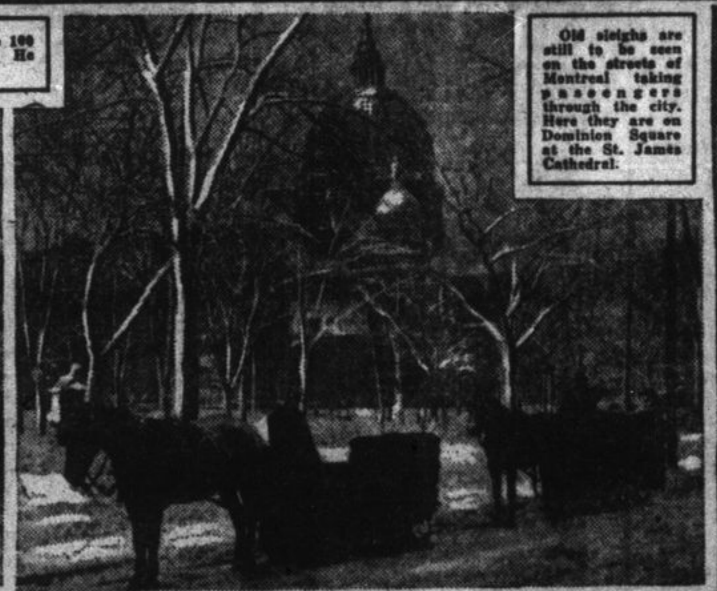
Old sleighs are still to be seen on the streets of Montreal taking passengers through the city. Here they are on Dominion Square at the St. James Cathedral.