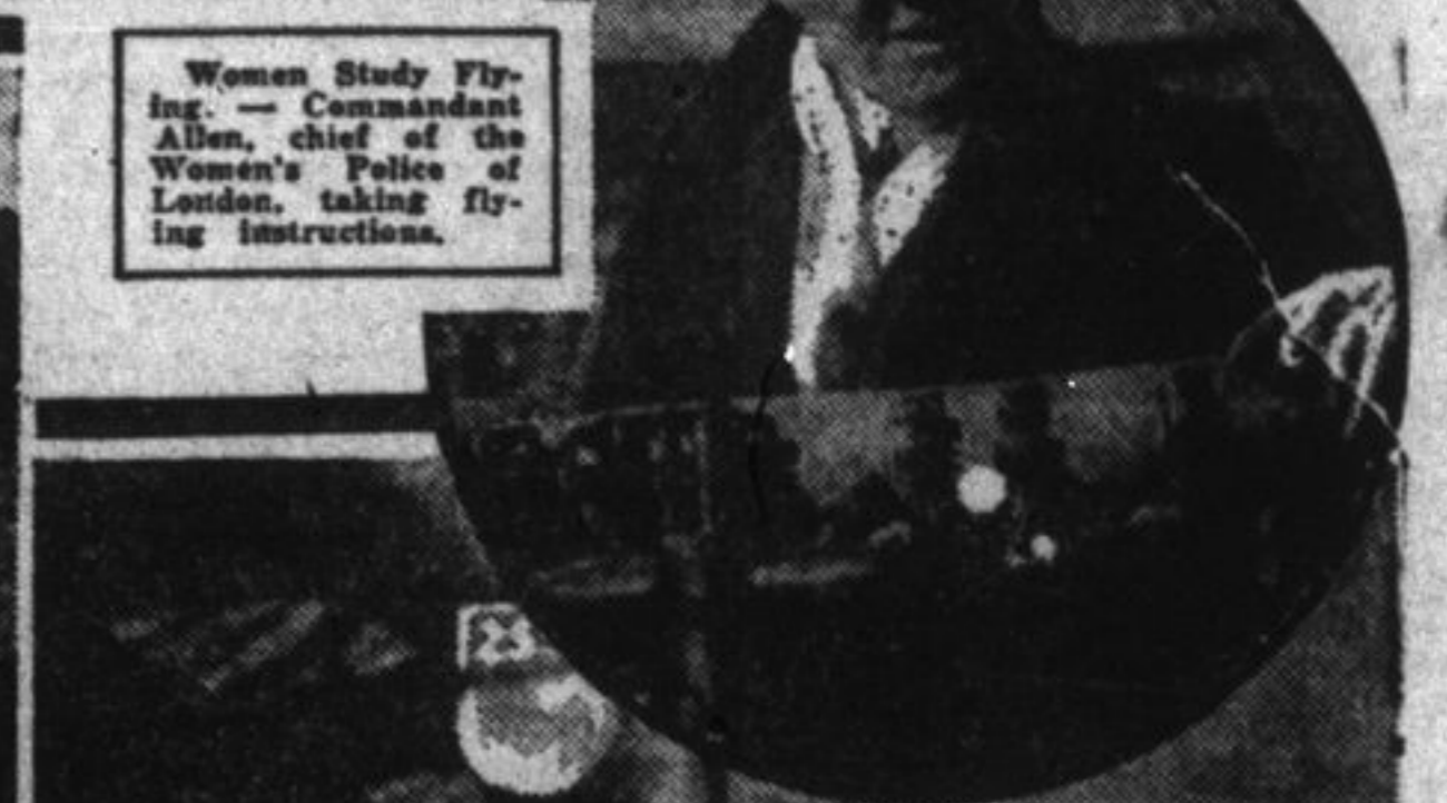
Women Study Flying.—Commandant Allen, chief of the Women's Police of London, taking flying instructions.