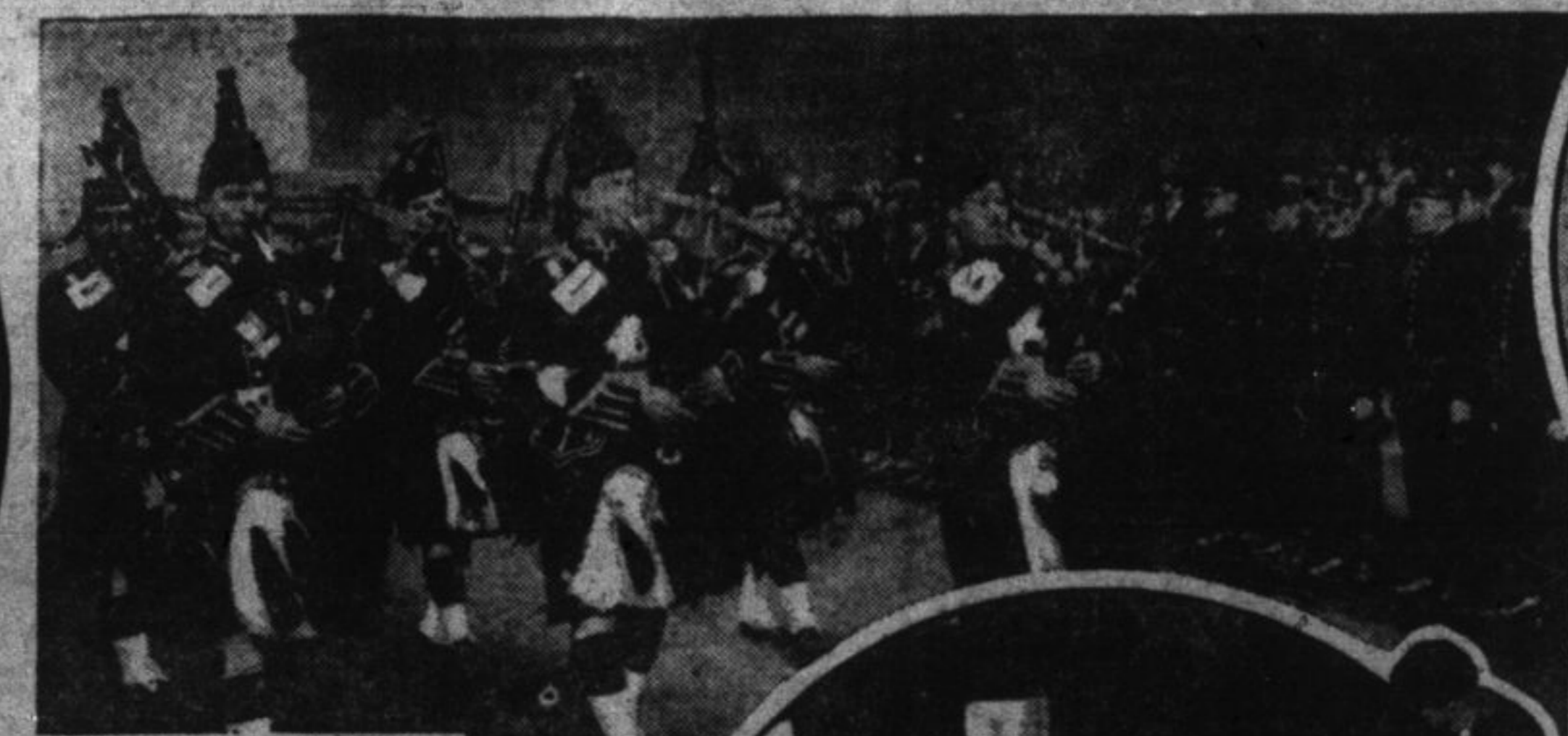
Paris Police were received at Scotland Yard, London, with a band of police pipers playing a processional march to the winners.