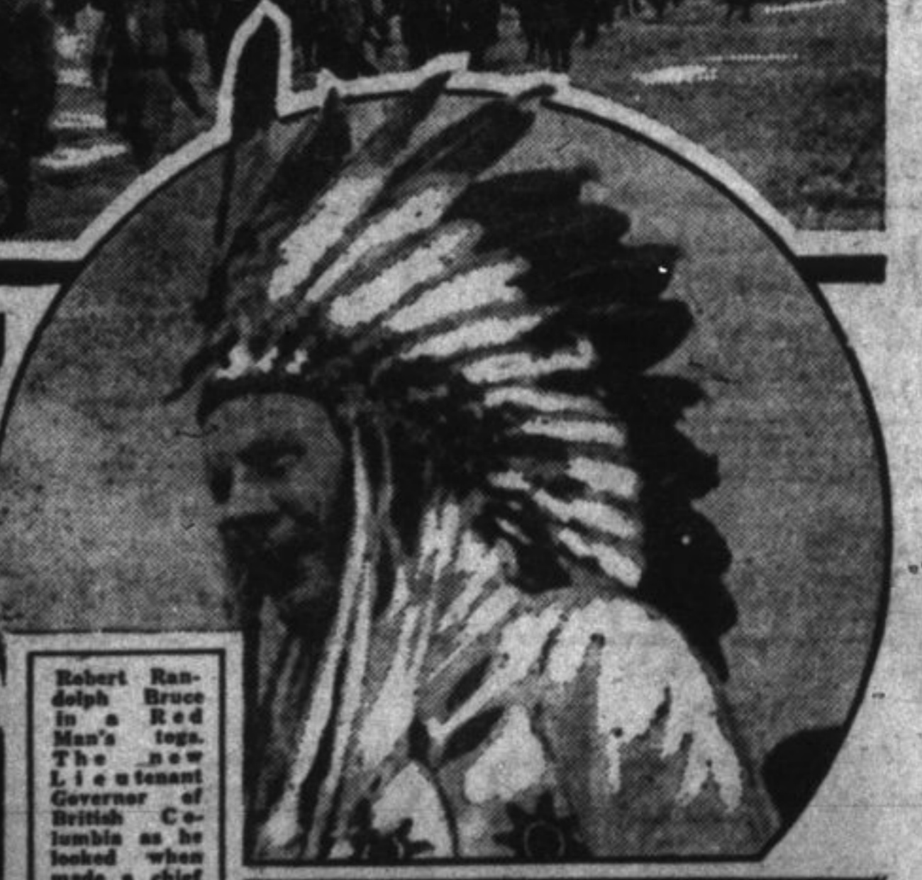
Robert Randall Bruce in a Red Man's tunic. The new Lieutenant Governor of British Columbia as he looked when made a chief of the Stoney Indians.