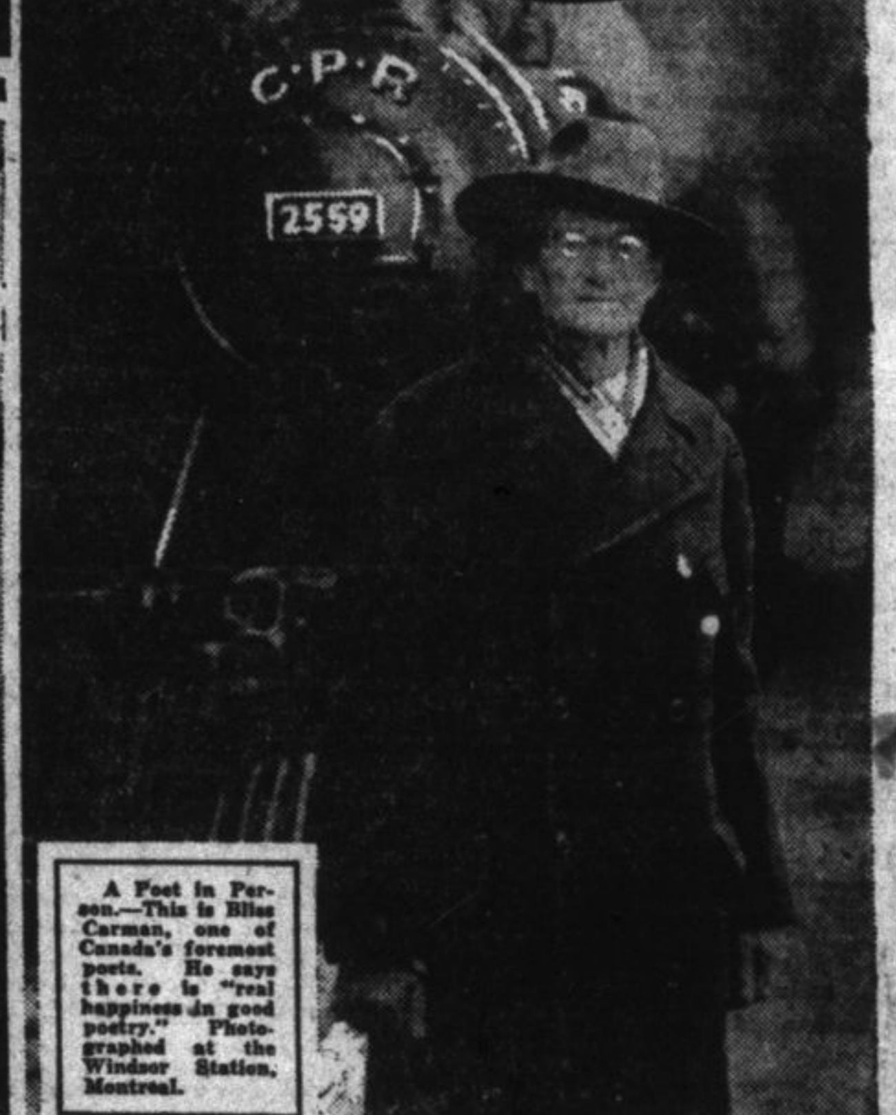
A Poet in Person.—This is Bliss Carman, one of Canada's foremost poets. He says there is "real happiness in good poetry." Photographed at the Windsor Station, Montreal.