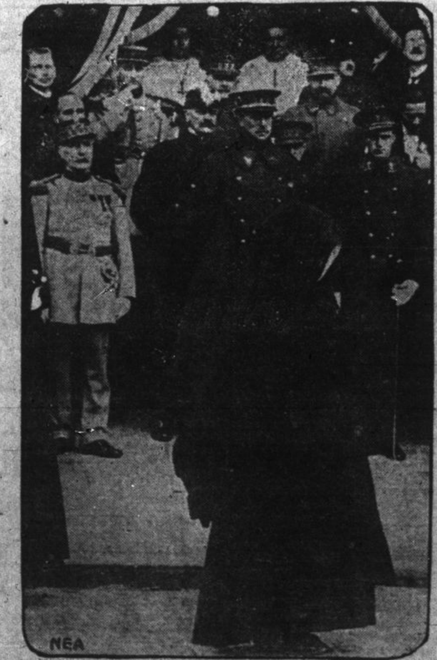
King Albert and Marshal Foch at the funeral of Cardinal Mercier at Malines.