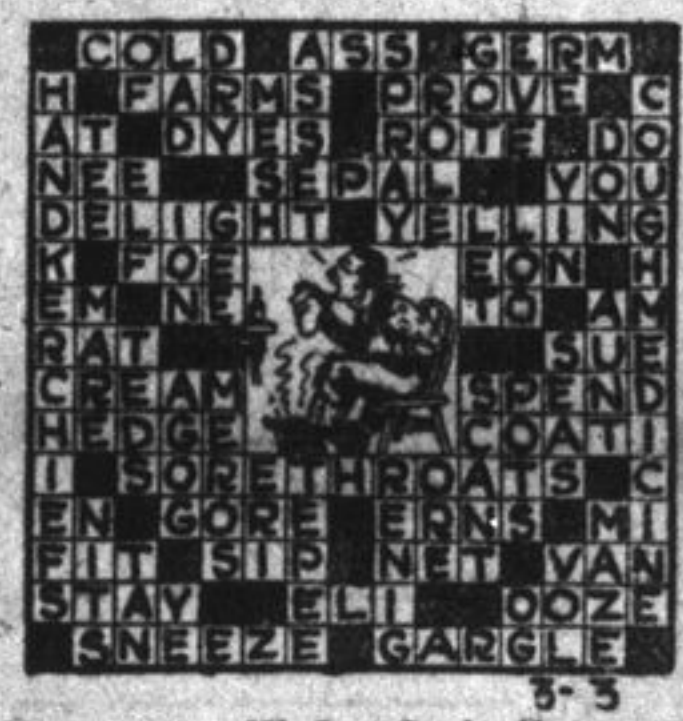
Answer to Wednesday's Crossword Puzzle.