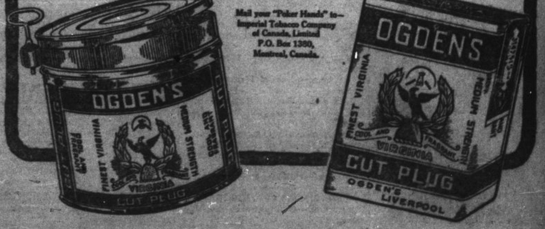
Mail your "Poker Hands" to— Imperial Tobacco Company of Canada, Limited P.O. Box 1300, Montreal, Canada.

"Poker hands" now packed in each package and tin of OGDEN'S CUT PLUG Smoking Tobacco. Save these "poker hands" and for the return of any 52 (bearing any numbers) we will mail a pack of high grade playing cards. —Or for a complete set, numbers 1 to 52 inclusive, we will send 2 packs. There is no advertisement printed on the playing cards.