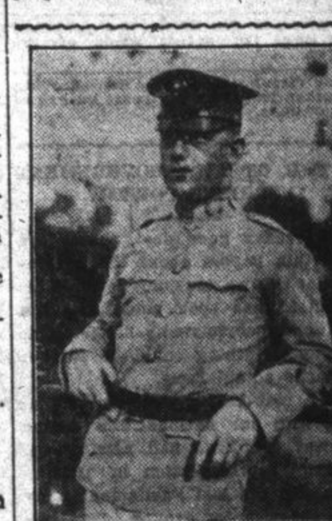
Tells how he got the cure of sprains and strains

STOMACH TROUBLES ARE DUE TO ACIDITY. Tells Safe, Certain, Speedy Relief for Acid Indigestion.