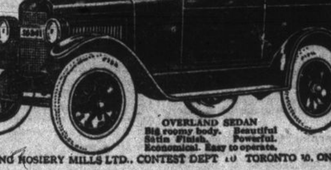
OVERLAND SEDAN Big roomy body. Beautiful styling. Powerful. Economical. Best in class.

wealth of romance, is to be closed in some measure at least to the public.