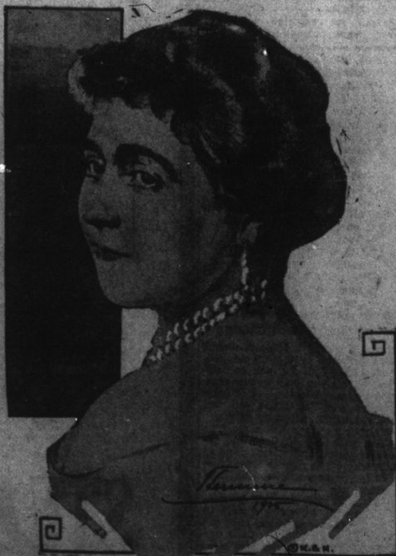
Princess Hermine, the wife of Wilhelm Hohenzollern, former kaiser of Germany.

SPIFFY, EH, WOT, IS PARASOL HAT? The parasol hat with from five to ten-inch brims may jam Fifth avenue on Easter Sunday. Designers offer it as their latest.