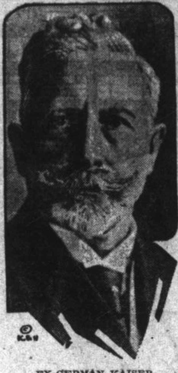
EX-GERMAN KAISER. The latest picture of Wilhelm Hohenzollern, who celebrated his 78th birthday anniversary at Doorn, Holland, on Wednesday.