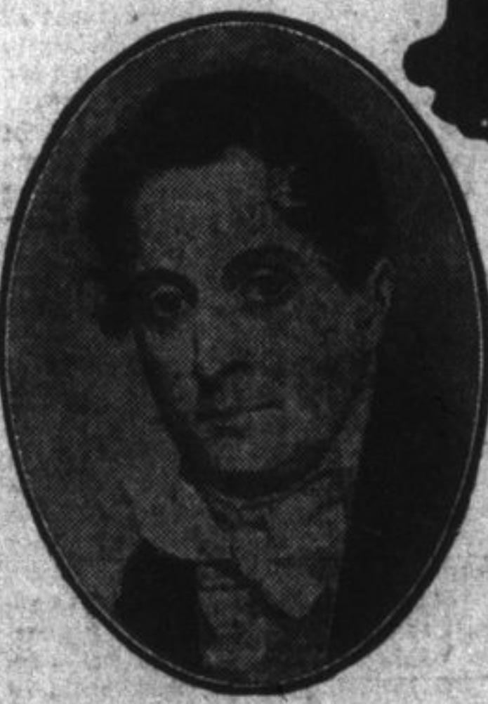
Sir William Harvey, English Scientist, Whose Discovery of the Circulatory System, Assisted so Greatly in Perfection of New Medical Discovery Which Heals Rupture.

If the truss was called into service, the hard leather knob was forced into the tear, where constant irritation wore thin the edges of the wound and the hard pressure prevented proper blood circulation. The sufferer was forced to resign himself to a lifetime of rupture suffering, never free from the harness of the truss. No hope was held out by scientists, that his rupture would ever disappear, although many manufacturers of appliances contended that such a thing was possible. Scientific investigation showed that it was impossible to heal the rupture as long as the heavy pad was being pushed into the rupture opening, separating