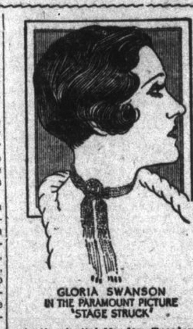
GLORIA SWANSON IN THE PARAMOUNT PICTURE 'STAGE STRUCK'

ing utensils are not absolutely clean. In these days of sanitary drinking cups, the insanitary drinking glass used by some dispensers of soft drinks is as antiquated and dangerous as the old-fashioned method of bleeding patients for any and all diseases. Avoid the common towel. Keep out of range of careless sneezers or coughers. A handkerchief held over the mouth and nose when you sneeze or cough will protect the people about you and prevent disease germs from traveling. Remember that cleanliness, fresh air, plenty of sunshine, the protecting of others by keeping your mouth and nose covered with a handkerchief when you cough or sneeze, avoiding common drinking utensils, and getting plenty of sleep will help you to keep closed the main traveled roads along which march these harmful bacteria, the germs of disease.