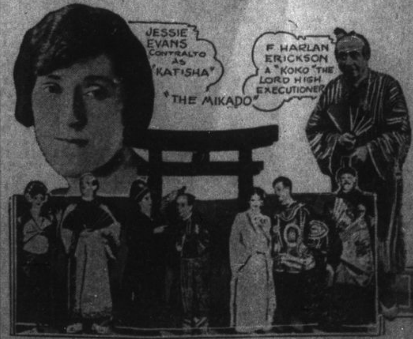
Scenes from "The Mikado" to be presented by the Brandon Opera Company, at the Grand Theatre, Wednesday, January 6th.