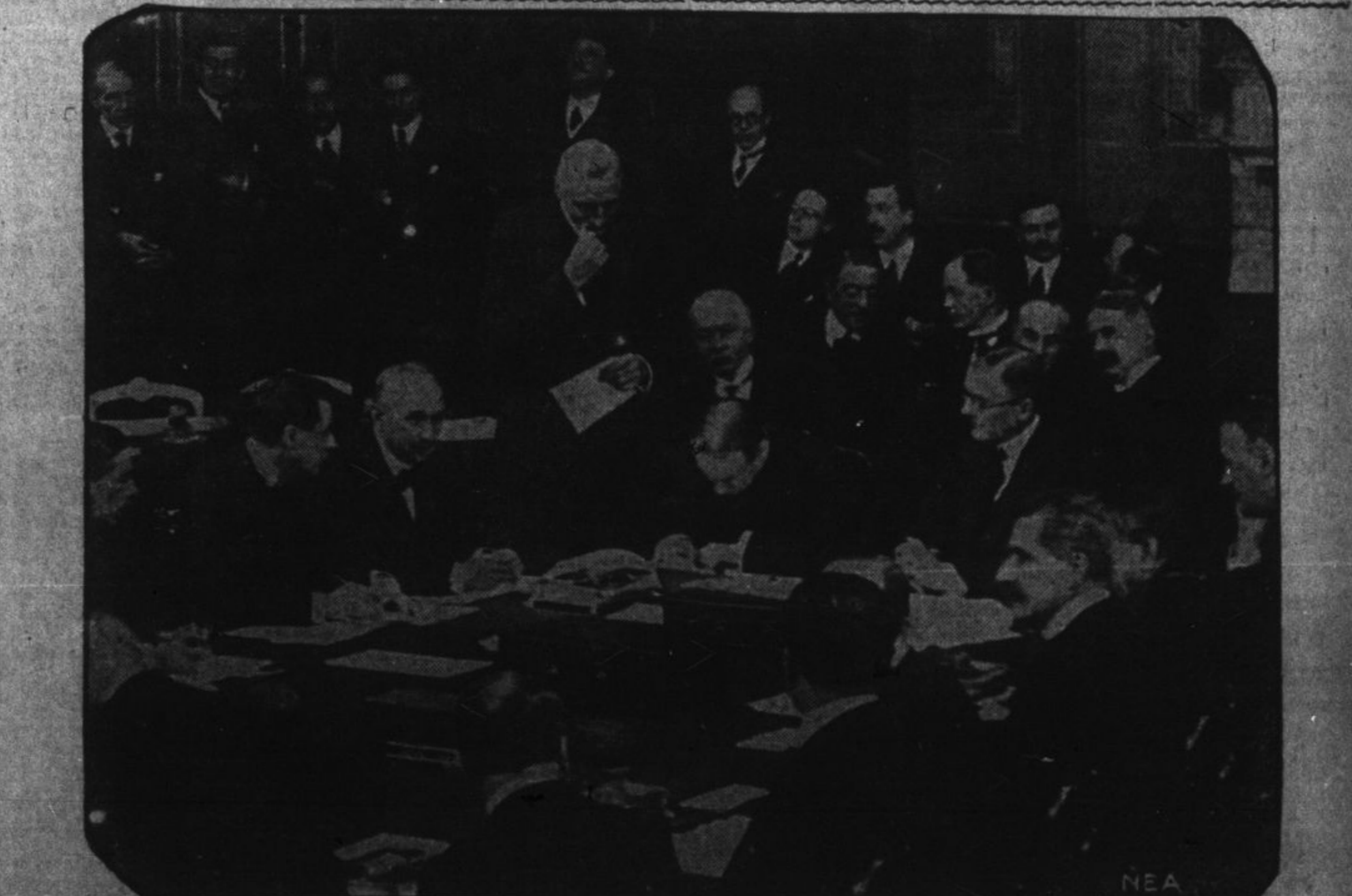
THE LOCARNO PACT SIGNING —Here is a photograph of a scene that will go down in history. It portrays the culmination of one of the greatest moves for peace in the history of modern Europe. It shows the signing of the Locarno agreement in the gold room of the foreign office at London. This picture records the actual signing by Premier Baldwin on behalf of Great Britain. Grouped around him are plenipotentiaries of Germany, Belgium, France, Italy, Poland and Czechoslovakia, about to sign the piece of paper that pledges their nations to mutual trust and peace.