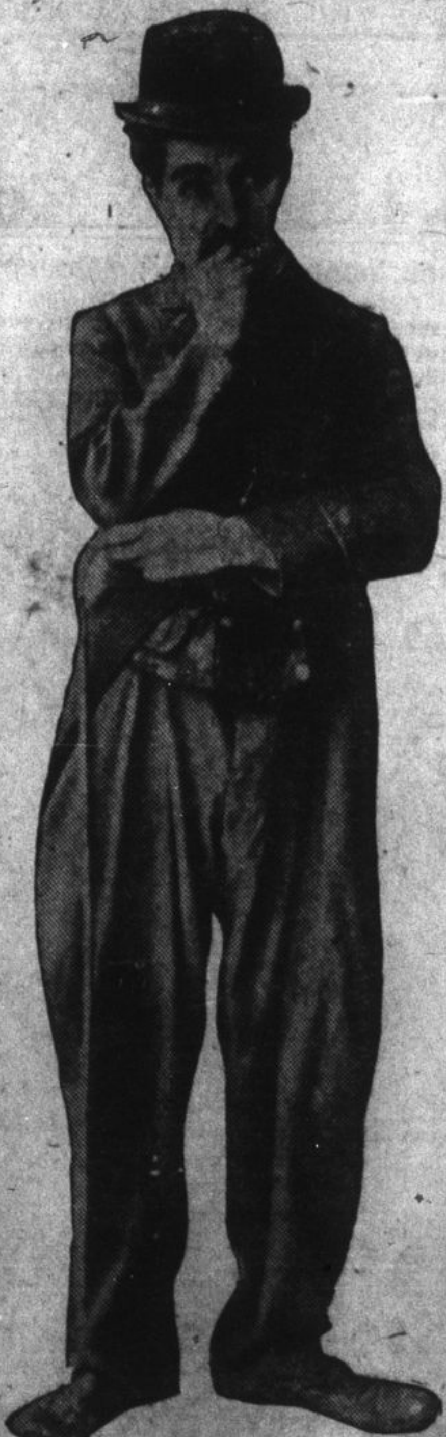
Charlie Chaplin in his latest comedy success "The Gold Rush," at the Capitol Wednesday, Thursday, Friday and Saturday.

Accept only genuine "Phillips," the original Milk of Magnesia prescribed by physicians for 50 years as an antacid, laxative, corrective. Each bottle contains full directions. Any drug store.