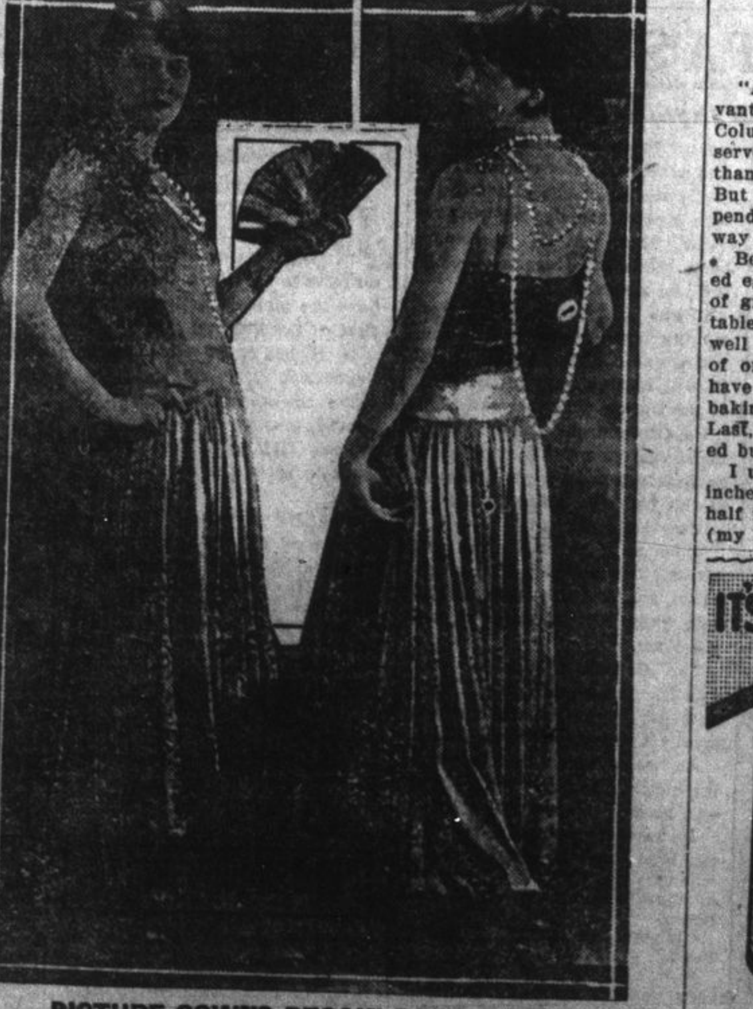
PICTURE GOWNS REGAIN POPULARITY Gown of lustrous gold brocade with very full skirt lifted at the hemline to show smart irregularity.

A Fresh Translation of an Old Classic. "If I can speak with the tongues of men and of angels, but am destitute of love, I have become a loud-sounding trumpet or a clanging cymbal."