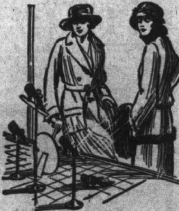
Made in Black, Tan, Toney Red and Dark Brown. Also White Dressing (cake) and White Cleaner (liquid).

New harbor is to be built at Funchal, capital of Madeira, sufficiently large to accommodate the largest Atlantic liners.