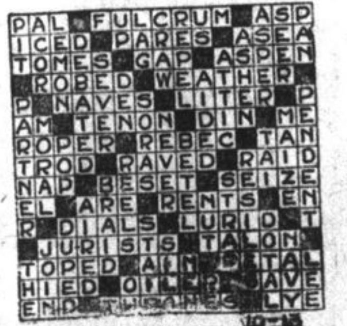
Answer to Tuesday Crossword Puzzle:

Toronto. Toronto, Oct. 13.—Export steers, choice, $7.25 to $8.25; do. heifers, $6.85 to $7; do. bulls, $4.50 to $5.25; choice store dehorned, $6.75 to $7.25; butchers, choice, $7.25 to $7.50; do. medium, $5.75 to $6.75; do. common, $4 to $5; baby heaves, $8 to $11; cows, fat, choice, $4.25 to $5.25; do. canners and cutters, $2 to $2.75; bulls, butcher, good, $4.50 to $5.50; do. medium, $3 to $4; feeding steers, choice, $5.50 to $6.25; stockers, good, $4.25 to $5.25; calves, choice, $12.50 to $13; do. medium, $9 to $10; do. grassers, $4 to $5; springers, choice, $8 to $10; milkers, choice, $7 to $8; spring lambs, per cwt., $10 to $12; do. yearlings, $8 to $9; buck lambs, $10 to $10.50; sheep, choice, $6 to $7; do. heavy, $4.50 to $5; hogs, L. o.b., $12.25; do. off cars, $13.25. Select bacon, off cars, $2.51 premium, per head. Montreal. Montreal, Oct. 13.—Cattle—Butcher steers, good, $6.50 to $7.25; medium, $5.25 to $6.25; common, $4 to $5; butcher heifers, good, $5.75 to $6.40; medium, $4.50 to $5.50; common, $3.50 to $4.25; butcher cows, good, $4.25 to $4.75; medium, $3 to $4; canners, $2; cutters, $2.50 to $3; butcher bulls, common, $2.75 to $3.50. Good veal,