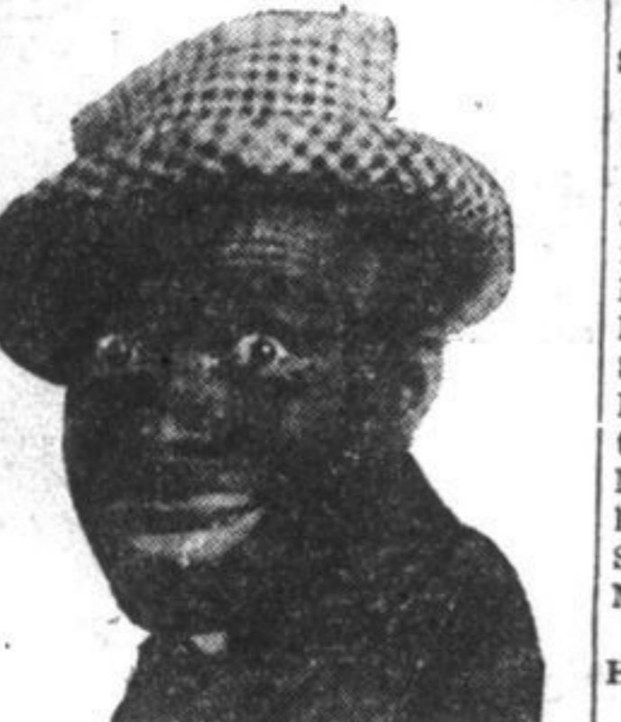
With the Georgia Minstrels at the Grand Theatre, Saturday, August 29th, matinee and night.