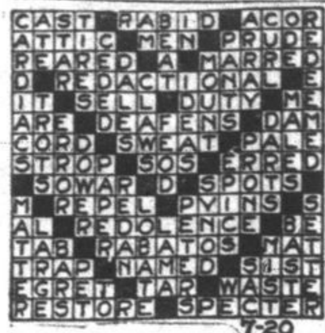
Answer to Monday's Crossword Puzzle.