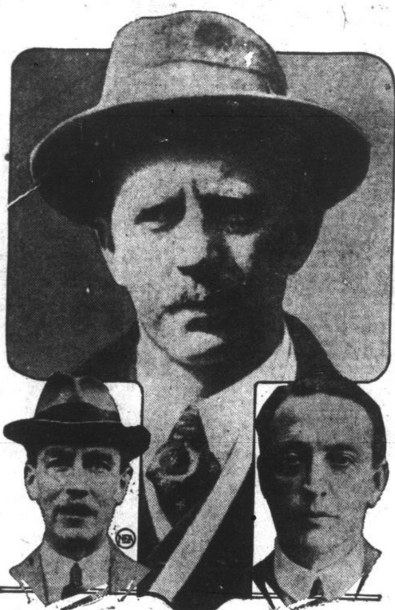
A. J. Cook, British miners' leader (above); Major G. R. Lane-Fox (left), and Sir A. Steel Maitland (right).

PROBS: —Scattered showers, mostly fair. Wednesday, fair and cooler.