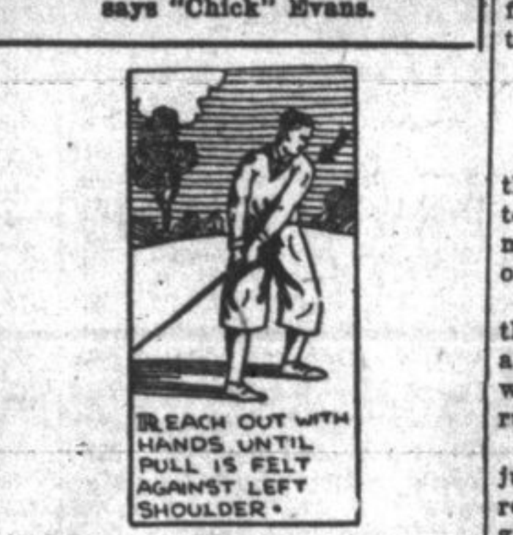
REACH OUT WITH HANDS UNTIL PULL IS FELT AGAINST LEFT SHOULDER.