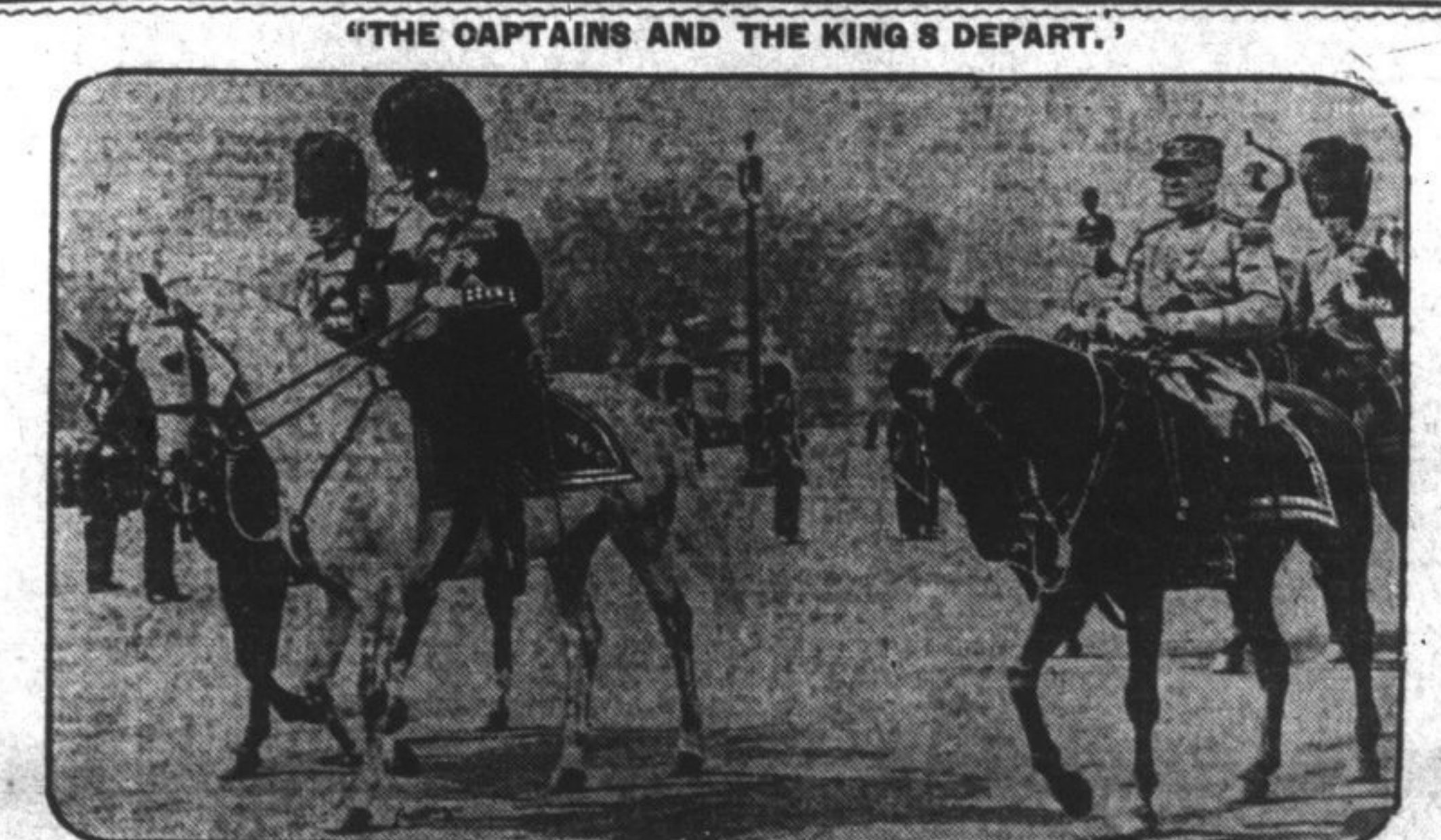
A squad of notables arrayed in their brightest panoply leaves Buckingham Palace to take part in the ceremonial "trooping of the colors" in honor of the king's birthday. Left to right, the Duke of Connaught, King George, the Duke of York, Marshal Foch, Viscount Lascelles.