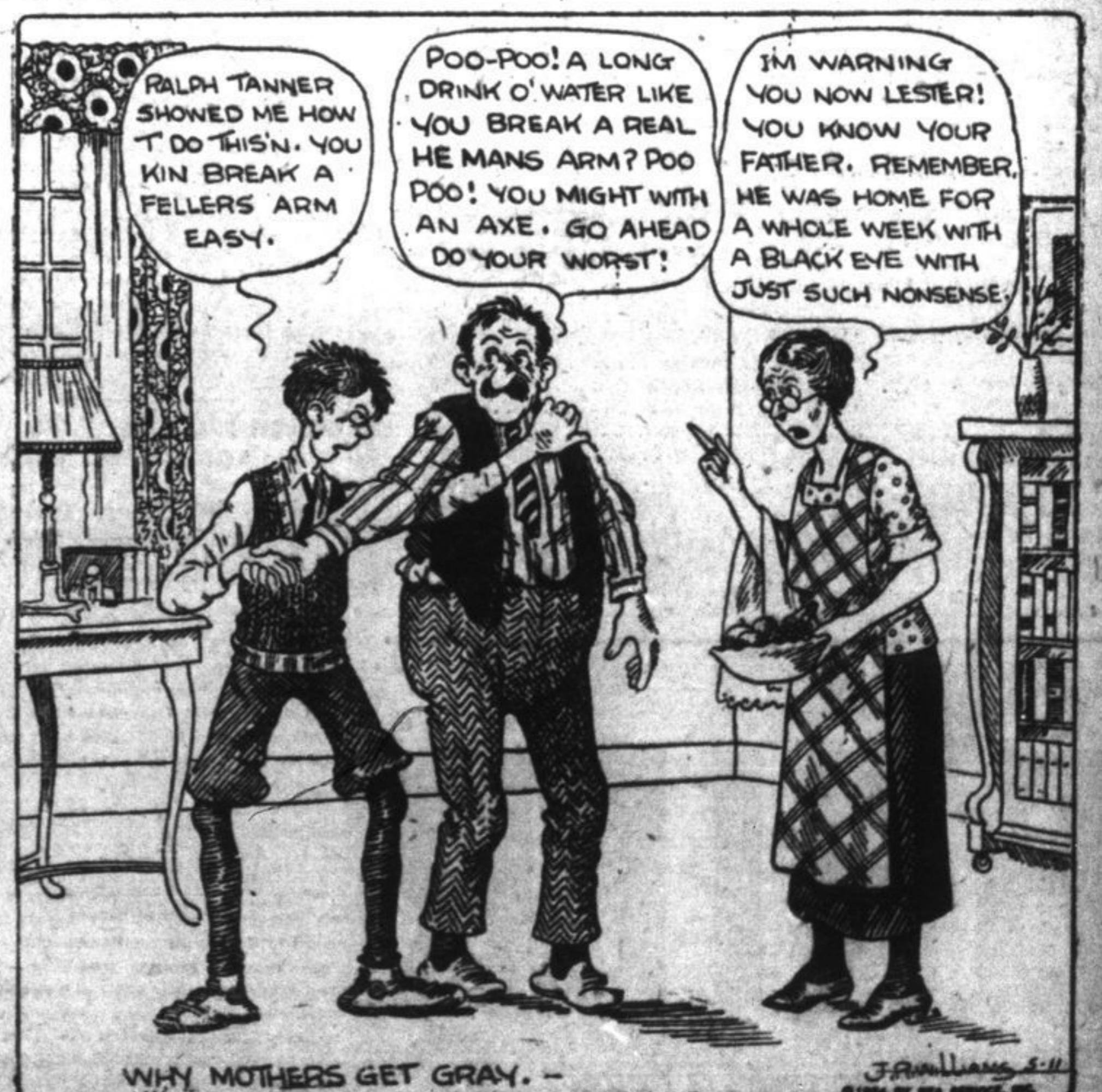
WHY MOTHERS GET GRAY.