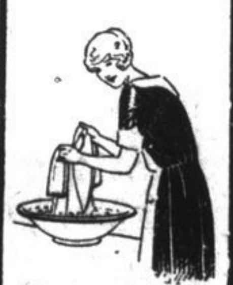
Dip repeatedly in this pure, rich lather. Do not rub.