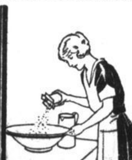
Toes Lux into very hot water and whip into lather.