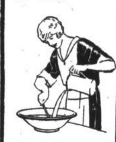
Add cold water until easily bearable to the hands.