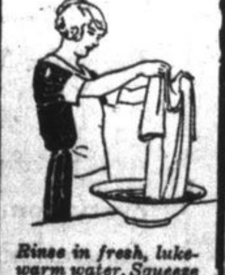
Rinse in fresh, lukewarm water. Squeeze water gently out, without wringing.