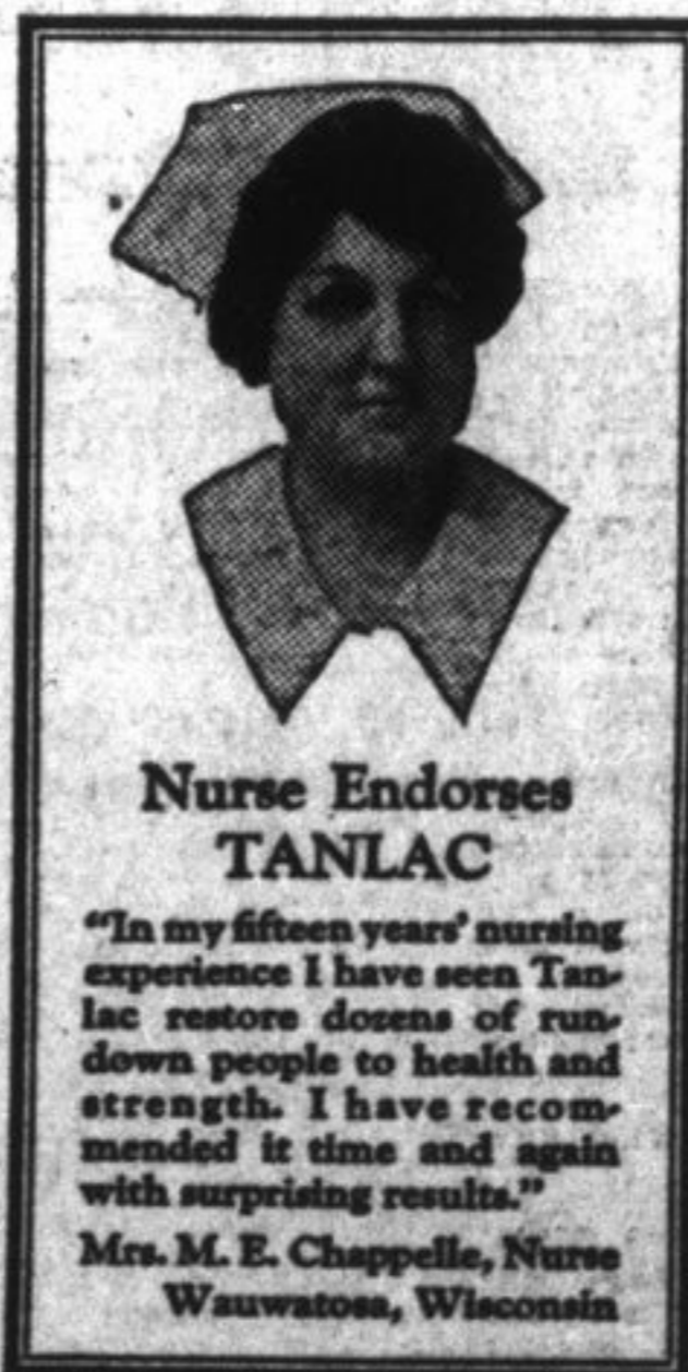
Nurse Endorses TANLAC

If your body is skinny and run-down; if you can't eat or sleep, have fits of nervousness, pimply complexion, you need Tanlac to put some solid flesh on your starved bones and bring you back to health. Tanlac is Nature's great tonic and builder. It is made, after the famous Tanlac formula, of roots, barks and curative herbs gathered from the four corners of the globe. Get a bottle of Tanlac at your druggist's today. Start the good work at once. You'll feel better right from the first. In a week's time you'll feel like a new person. For Tanlac gets right down to the seat of trouble. It purifies the blood, aids digestion, helps the appetite, puts on pounds of flesh. Millions of men and women who were once sickly and discouraged have been lifted right back to health and strength by the Tanlac treatment. Our files contain one hundred thousand glowing testimonials from grateful users. Tanlac will help you just as it has helped millions of others. Buy