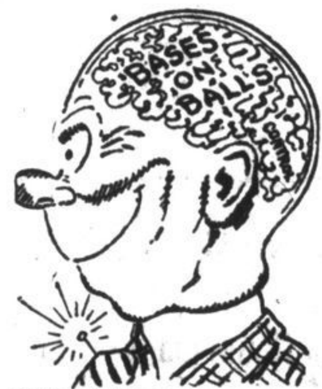
CROSS SECTION OF THE BRAIN OF A LEFT-HANDED PITCHER, ACCORDING TO DR. WILBERT ROBINSON, PITCHING SPECIALIST

YOU CAN PUT THE BALL OVER THE PLATE IF YOU THINK YOU CAN. WHY ARE YOU GOING TO DO UP THE SWING POINT THINKING YOU'RE OVER?