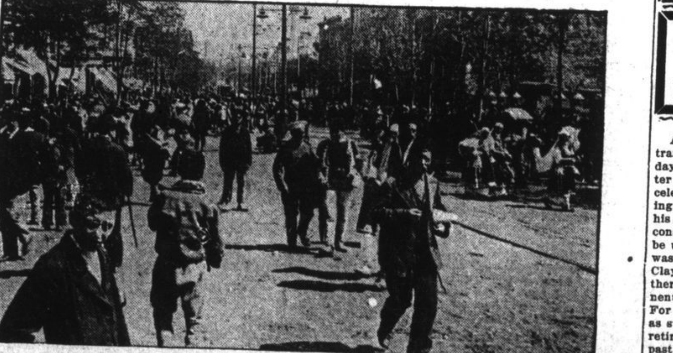
A typical street scene in Sofia, the capital of Bulgaria, where sharp clashes between police and reds resulted in more than 400 deaths, according to wire reports.