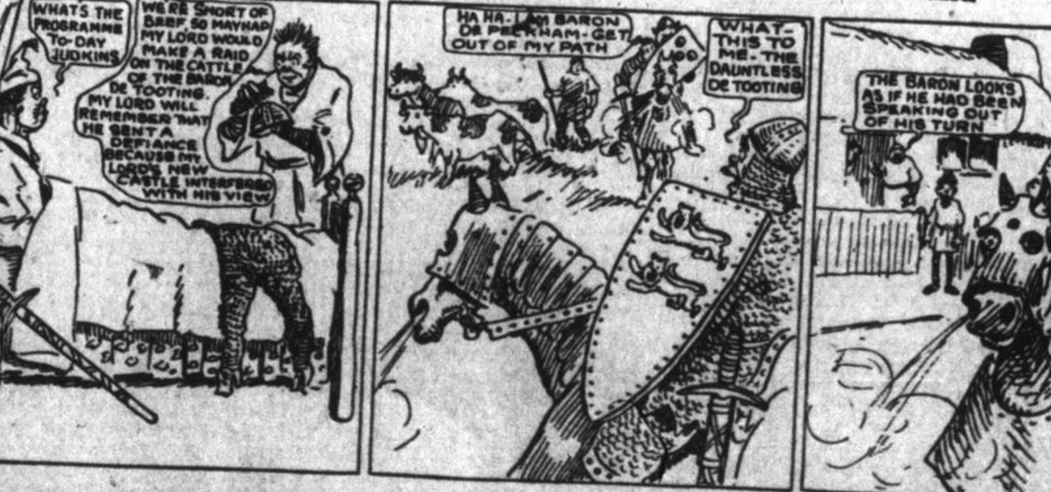
A.D. 1135.—Stephen's policy of allowing the Barons to establish themselves in their own stronghold led to anarchy. Instead of combining for the common weal, each played his own game. He was a petty king, and warred against his neighbor, the weakest going to the wall.