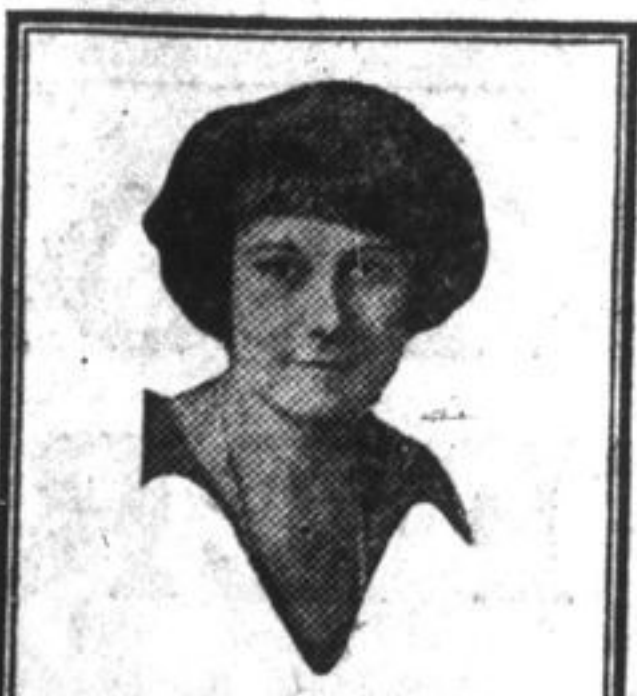
Made Her Feel Like New Woman

YOU simply can't expect to get back your health and strength as long as your body is scrawny and underweight. Let Tanlac put some good solid flesh on your bones, put your stomach in shape again and purify your blood. Then see how much better you feel.