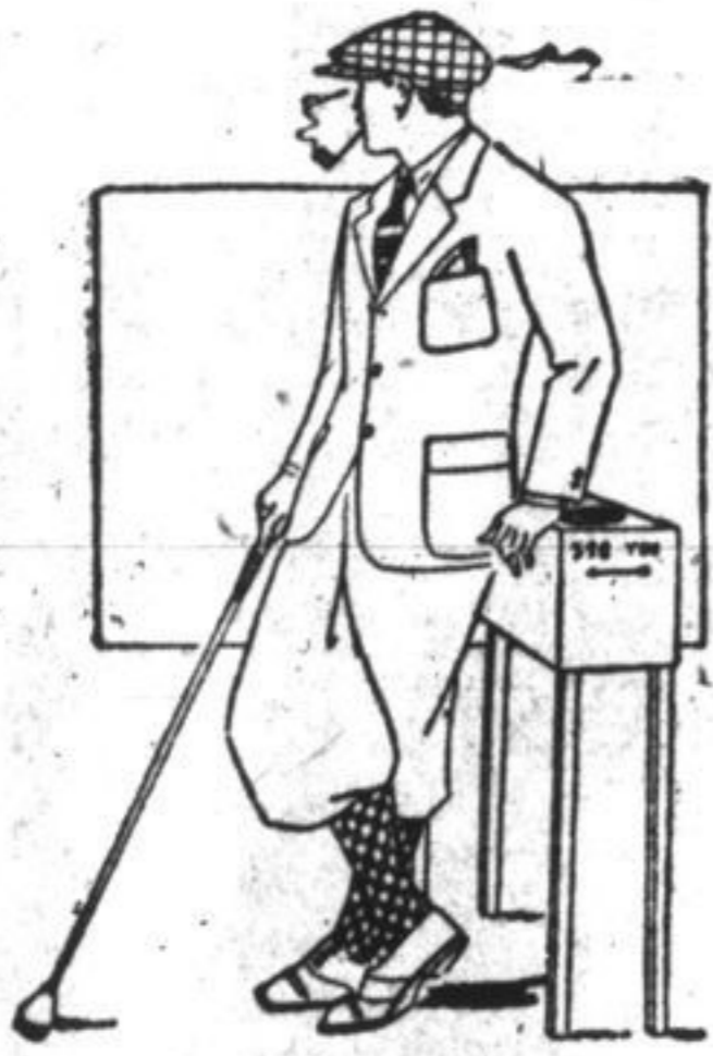
Our Golf Clothes