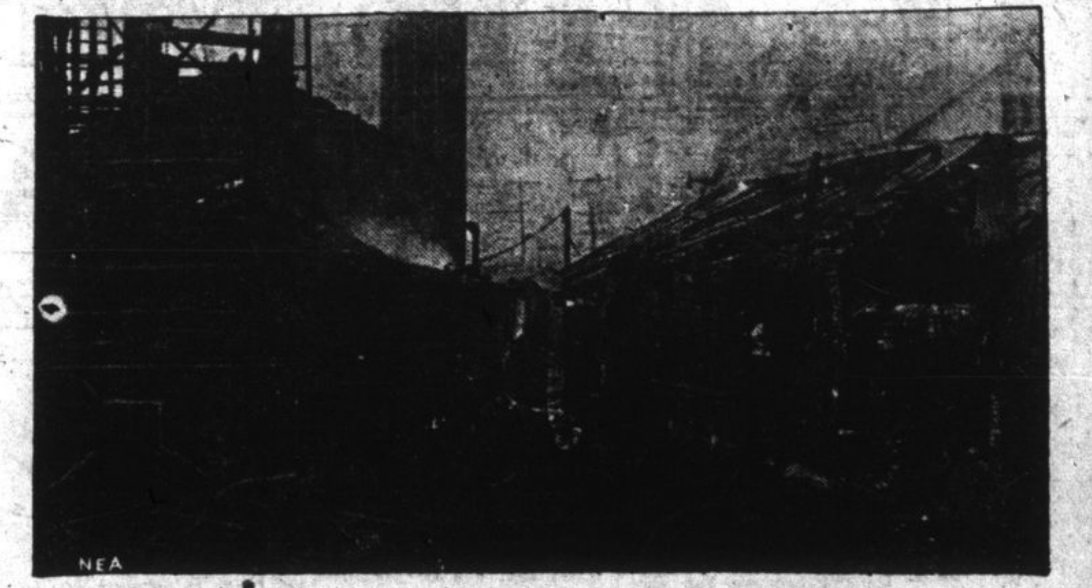
The picture above shows the boiler house after the explosion in the Barrackville mine near Fairmont, W. Va., in which thirty-four miners were entombed. Below you see the familiar scene at all mine disasters, relatives and dear ones waiting, waiting for word of the victims, hoping against hope that they may be found alive.