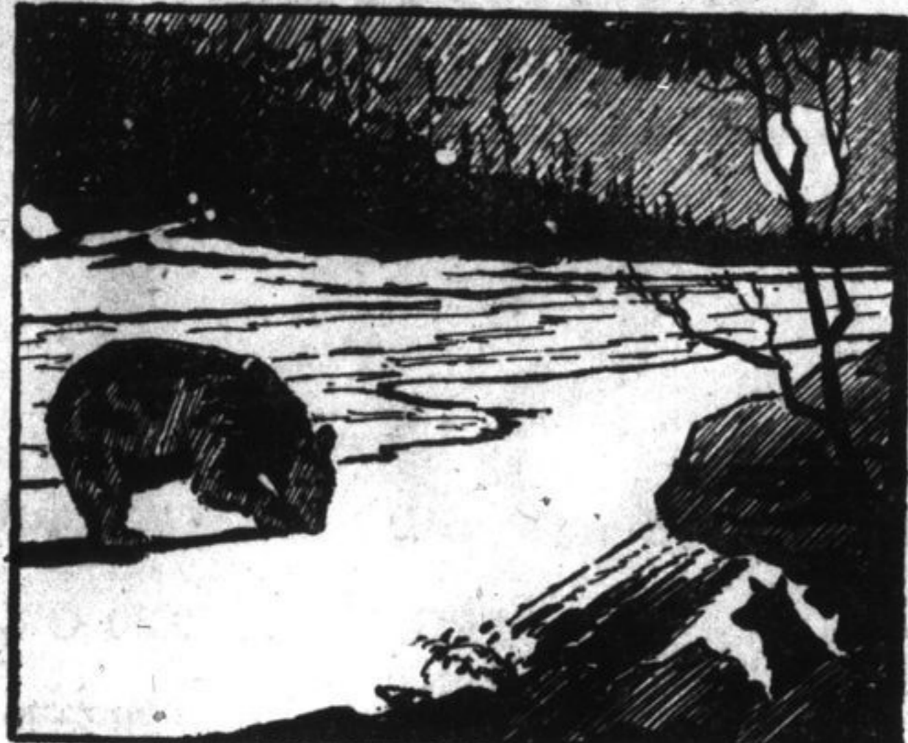
"Across this sand, half an hour later, came a huge black bear."

ed sort of way. His head and ears were no longer alert, and his curiosity was gone. He was not only stomach-hungry; mother-hunger rose above his physical yearning for something to eat. He wanted his mother as he had never wanted her before in his life. He wanted to snuggle his shivering little body close up to her and feel the warm caressing of her tongue and listen to the mothering whine of her voice. And he wanted Kazan, and the old windfall, and that big blue spot that was in the sky right over it. While he followed again along the edge of the creek, he whimpered for them as a child might grieve.