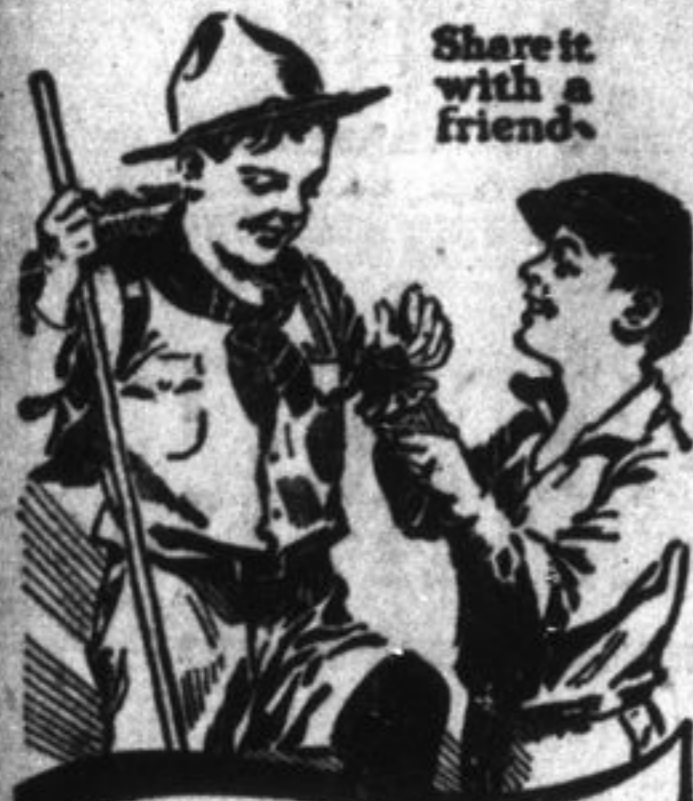
Share it with a friend.