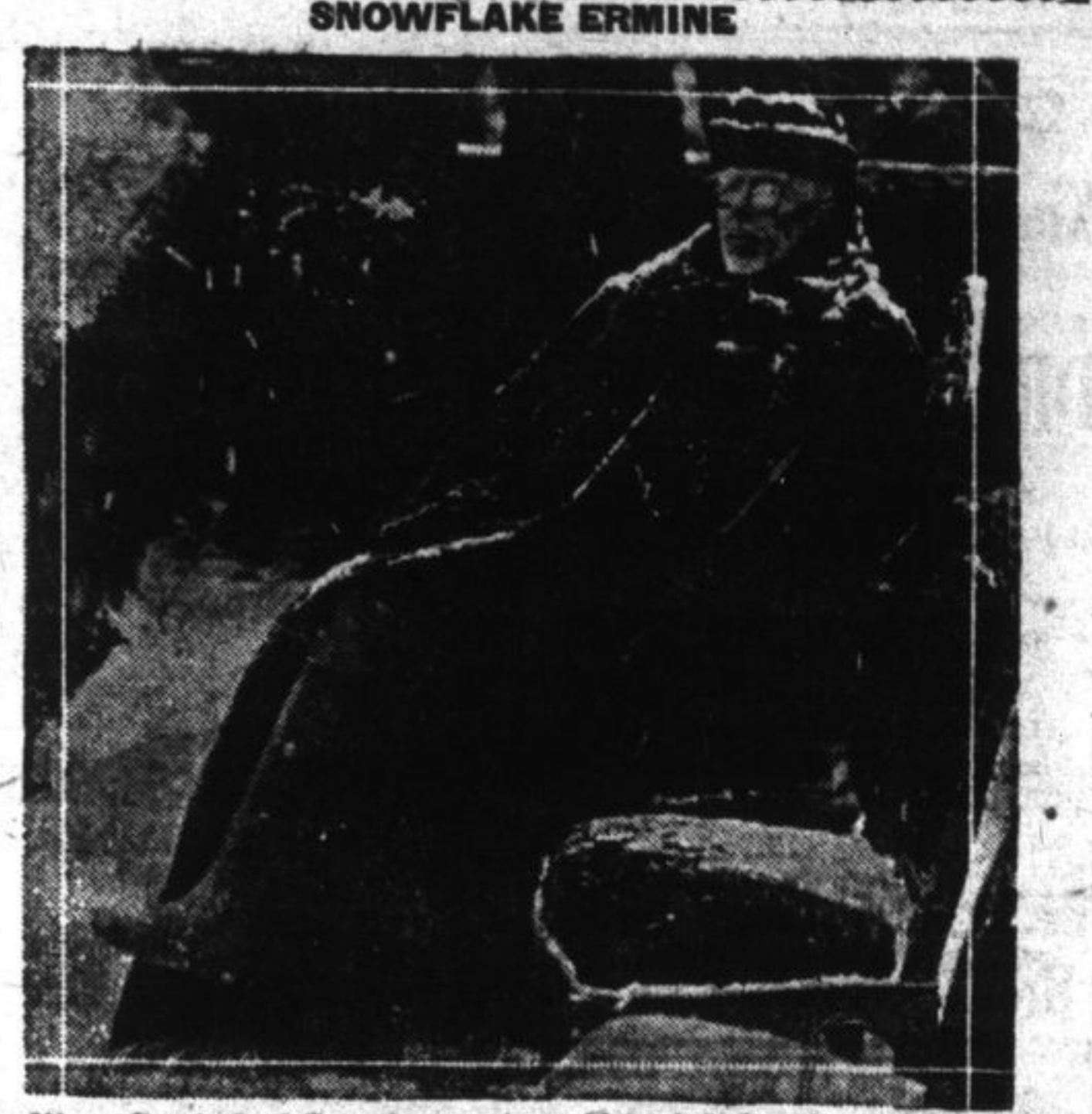
King Gustaf of Sweden puts on his felt boots and heavy old overcoat and braves the cold like any commoner. This picture shows him in the royal box of the Stockholm stadium at a winter sport carnival.

Fletcher's CASTORIA. MOTHER:—Fletcher's Castoria is a pleasant, harmless substitute for Castor Oil, Paregoric, Teething Drops and Soothing Syrups, especially prepared for Infants in arms and Children all ages.