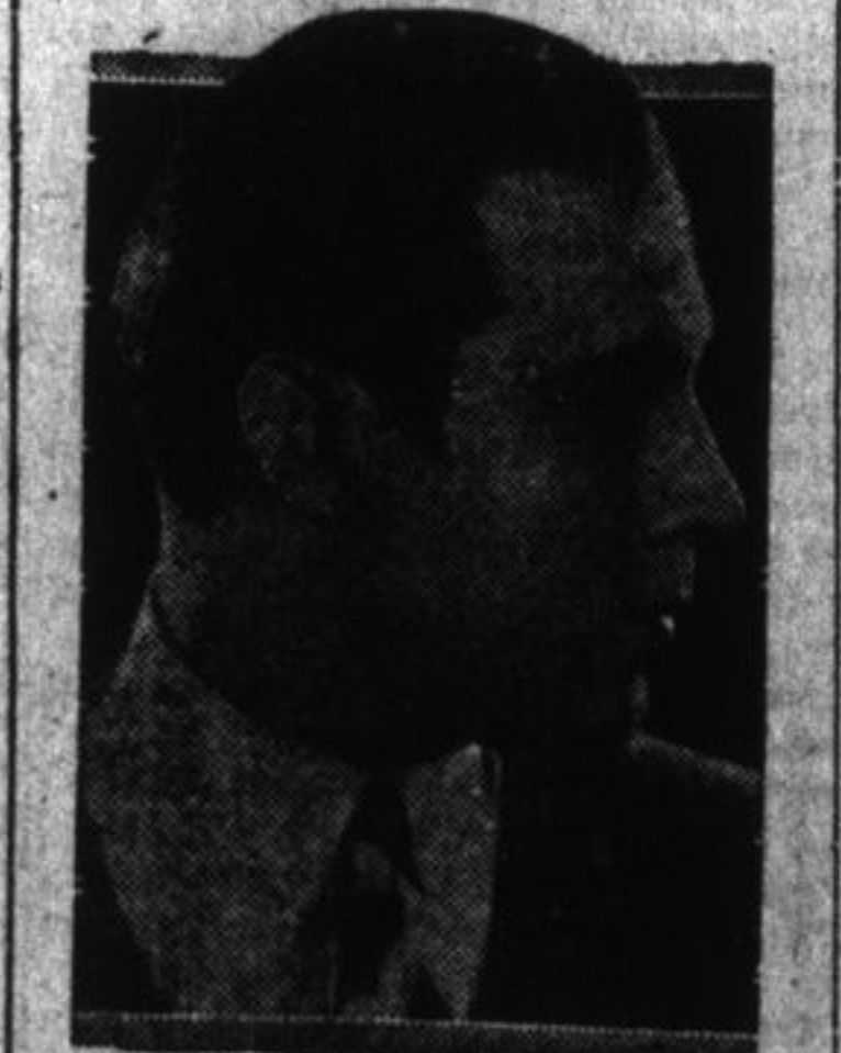
When Rudolph Valentino appeared with his sideburns cut in the above manner, friends too polite to suggest that he shaved himself dubbed it "the cobra cut."

The Presbyterian Church Association claims that of the votes cast up to Friday by congregations on church union showed a majority of 12,000 against. Large black cravats give chic to the white crepe de chine blouses that are worn with the tailored suit. Large collars of Persian lamb are used on traveling capes of jersey or ratine.