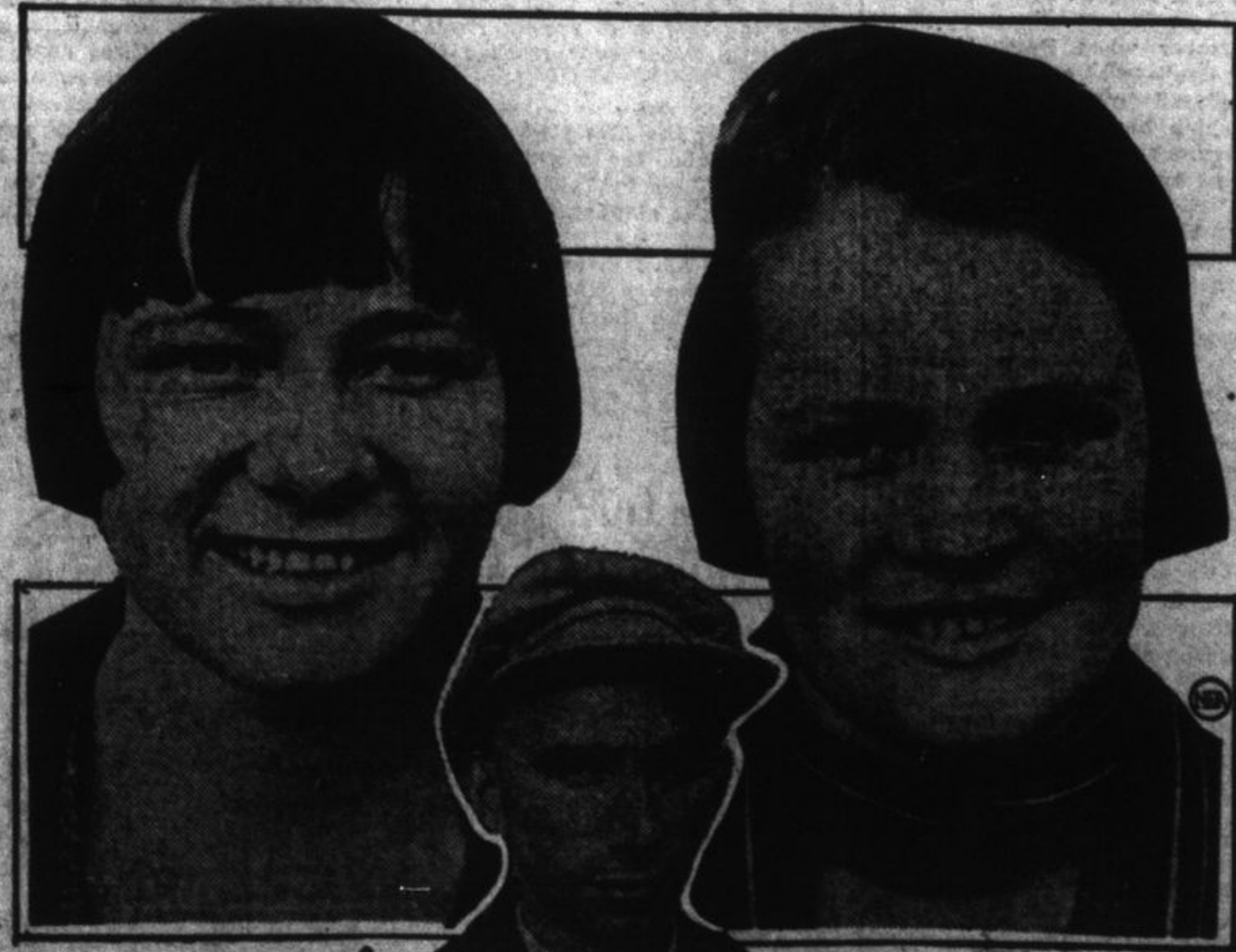
IRISH REFUGEE LAD AND COLLEENS

Do not buy vegetables or fruits of poor quality. The waste amounts to more than the saving in the first cost. Always keep a pot of beef extract on hand to use for soup on quick notice of to make gravy or meat sauce richer.