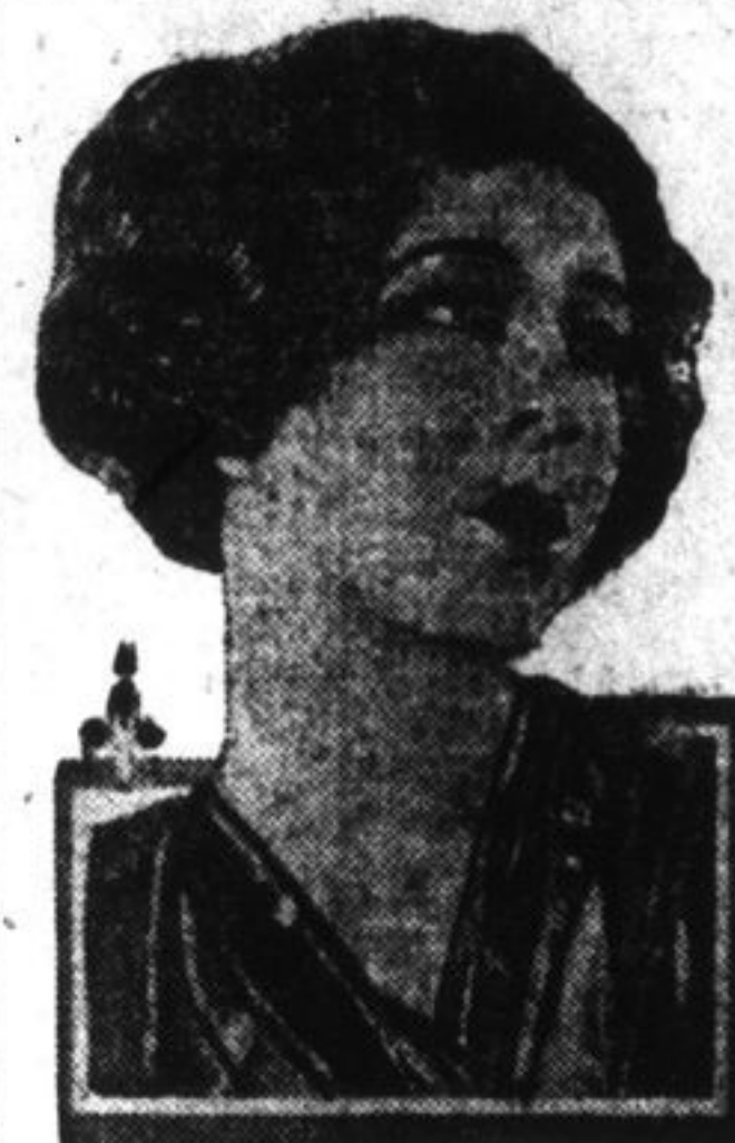
Nazimova in "Madonna of the Streets"

NAZIMOVA, SILLS CO-STAR IN NEW SCREEN TRIUMPH. Nazimova, the famous Russian actress, who made her first appearance in America several years ago and was immediately accepted as one of the world's great emotional actresses, has returned to the screen after an absence of two years.