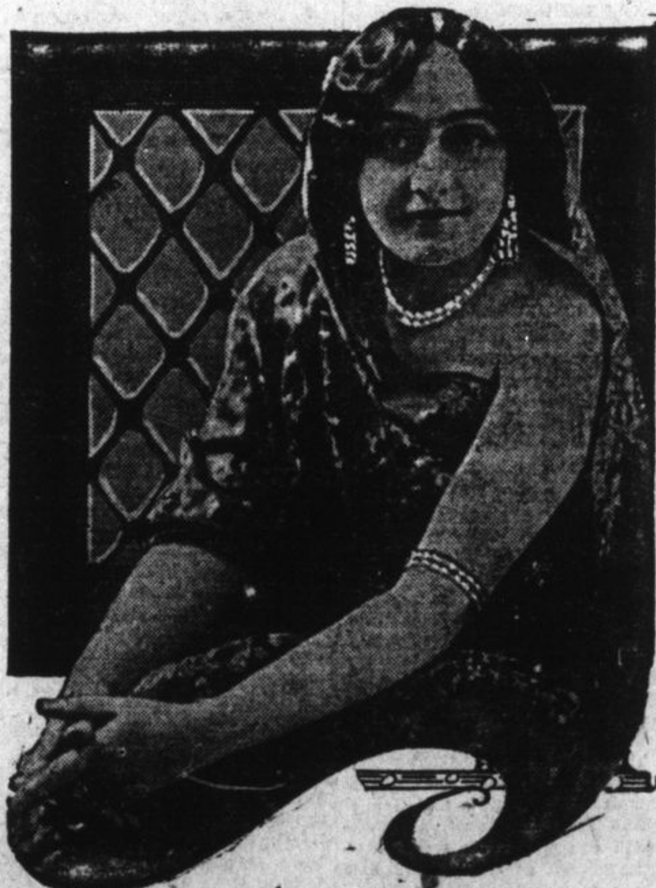
A ROSE OF INDIA

Chamois Suede Gloves Gauntlet style — large, flare cuffs. Beautiful assortment of shades. $1.25