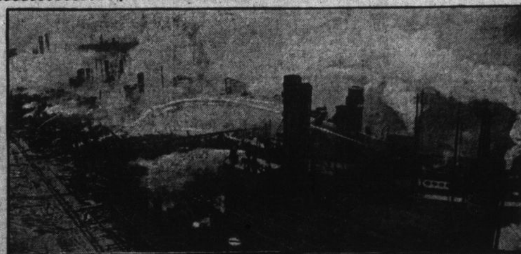
SECOND BIG JERSEY FIRE

The worst case that the society has had to deal with lately was that of a horse which had caught its leg in a wire fence and was released by a passerby who notified the negligent owner to see to it. The inspector and the veterinary went out to see it, and found its leg in a frightful condition. The poor creature was shot and the owner prosecuted and convicted.