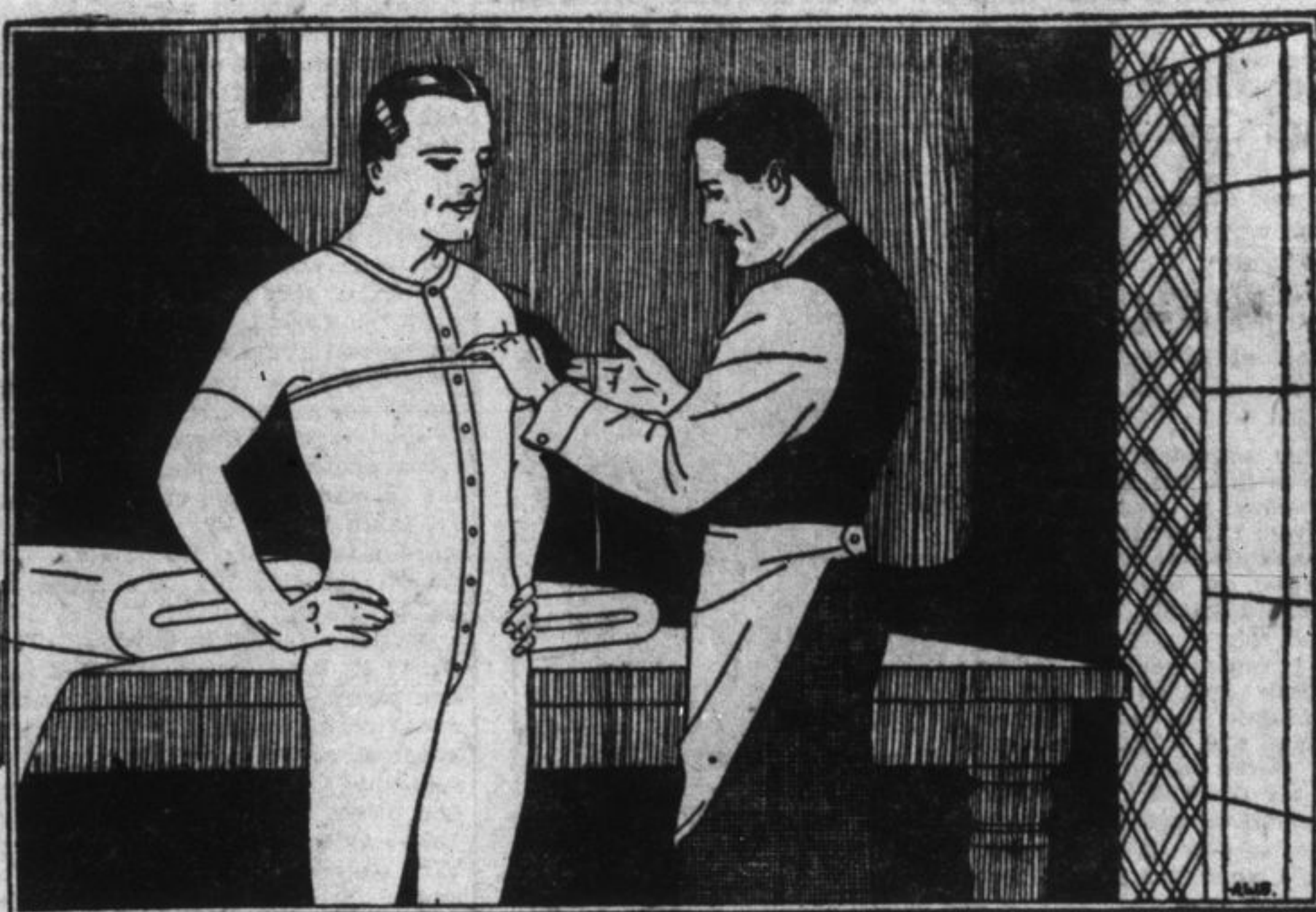
Three illustrated booklets showing Stanfield's wide range of styles and weights in men's, women's and children's underwear will be mailed on request. Write for them. STANFIELD'S LIMITED, TRURO, N.S.