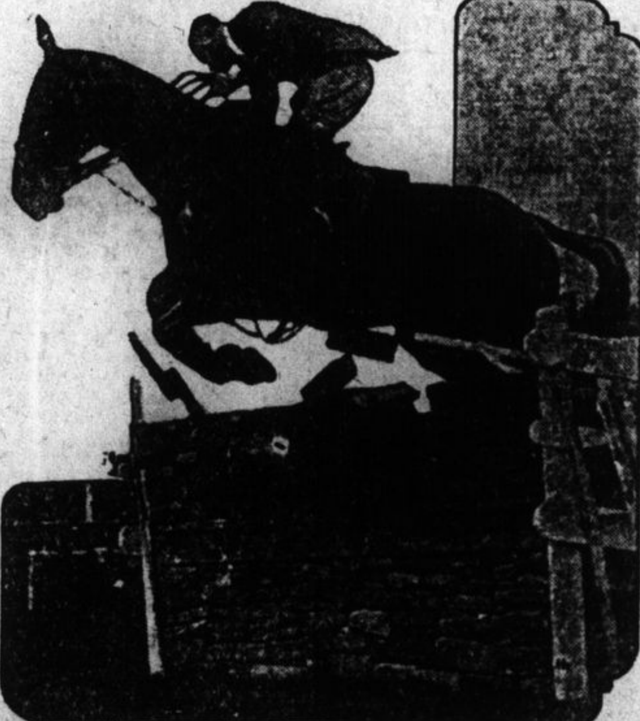
W. E. Jones shown jumping a wall on Monarch at the Cardiff Horse Show in England. Monarch kicked off a few layers of brick but didn't stub his toe.

Everyone knows Firpo telegraphs his right, but it is shocking to learn